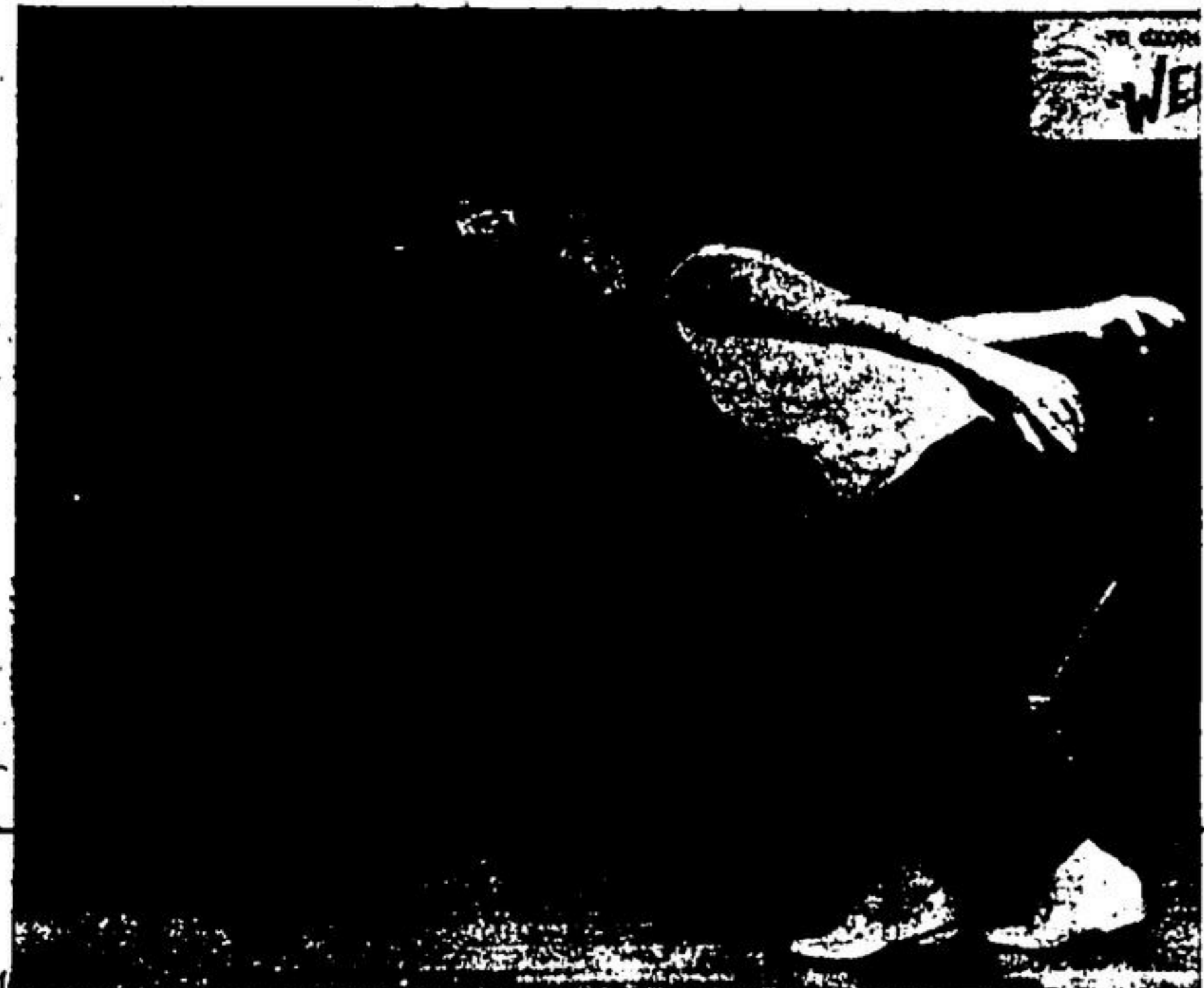
The thunder is back at Georgetown lanes

A Wednesday Ladies five pin is thriving, as well as The Hoop-annum, a mixed five pin league which bowls every Tuesday night. A men's 10 pin league has the alley Wednesday nights,