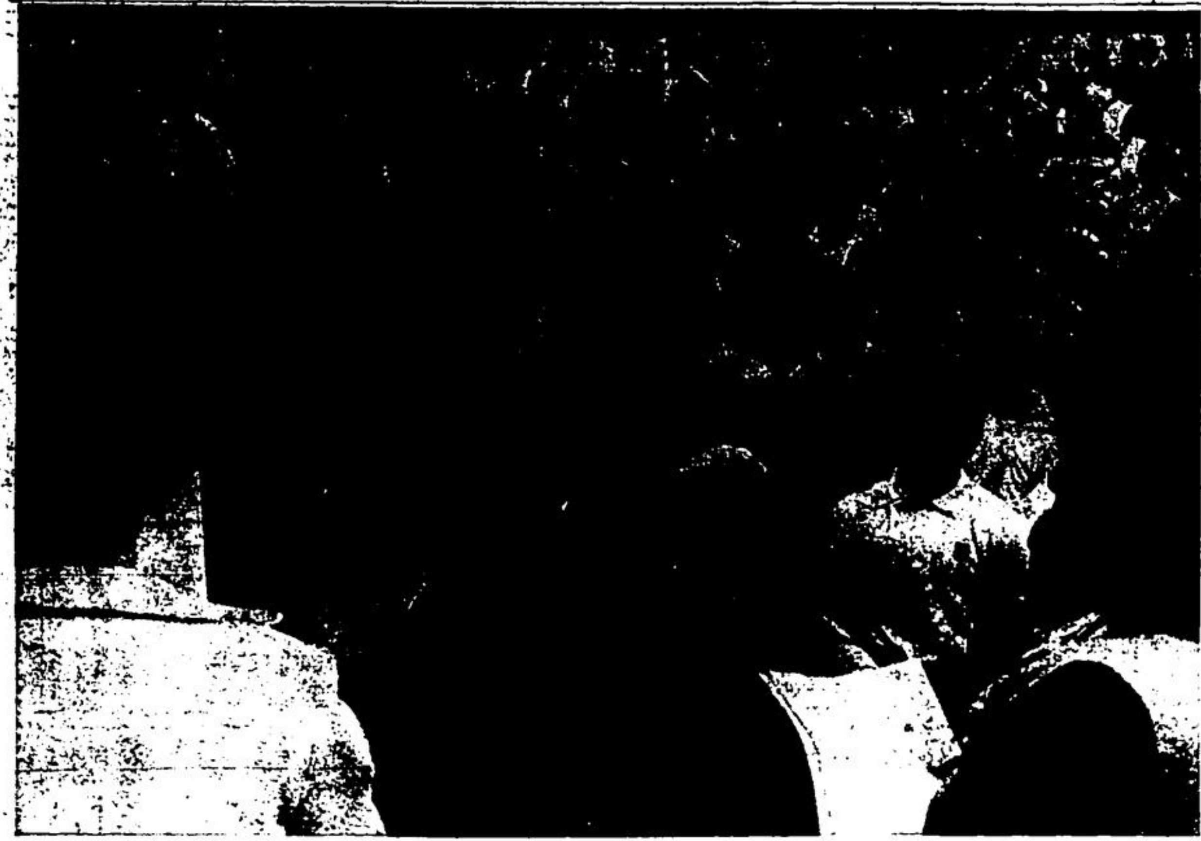
THE PARTY'S OVER

$5.00 per year, Single Copy Price: Ten Cents