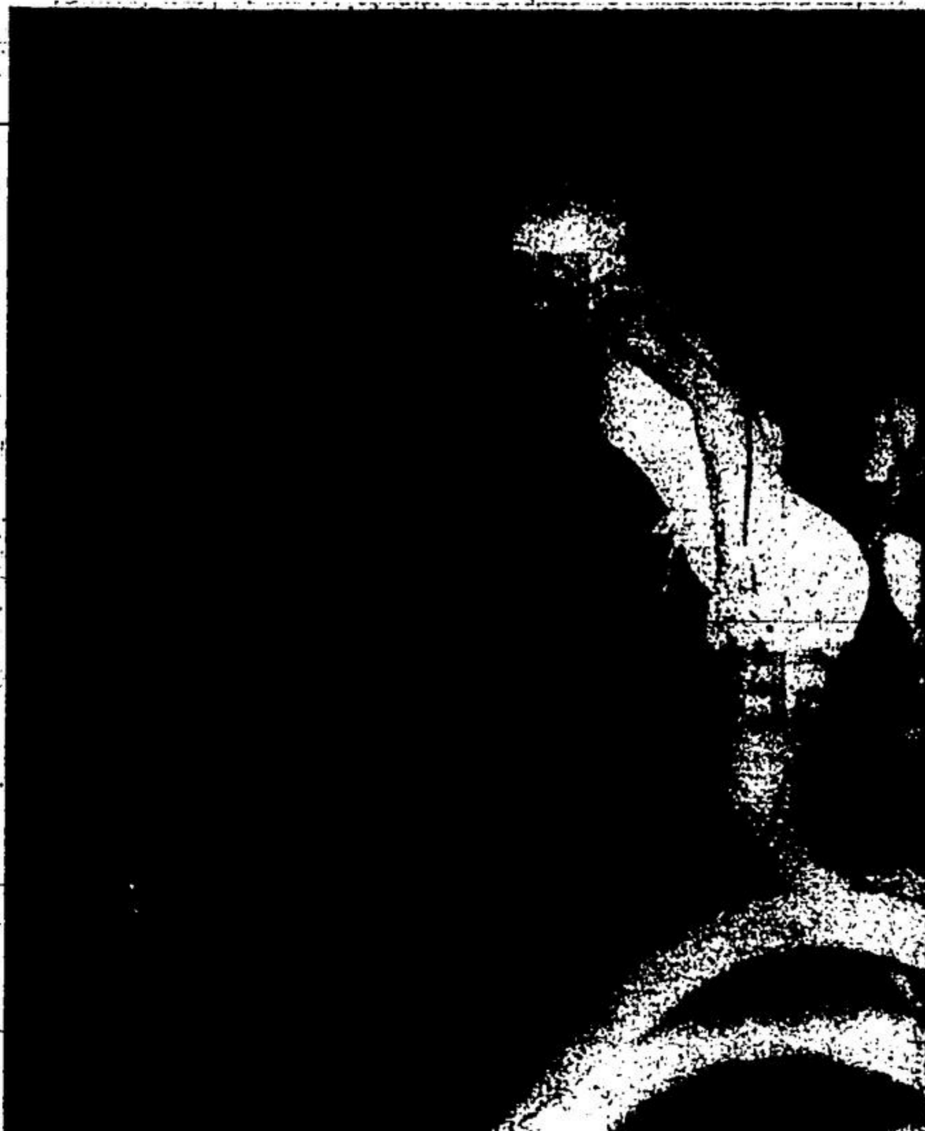
AN ADULT SWIM CLASS PUPIL, Mrs. Toots Burns, puts her new diving know-how into practice.

The exhibition, called Artists' Choice, is in the art building behind the pure food building at the Ex. It is open without charge to the public during the run of the CNE.