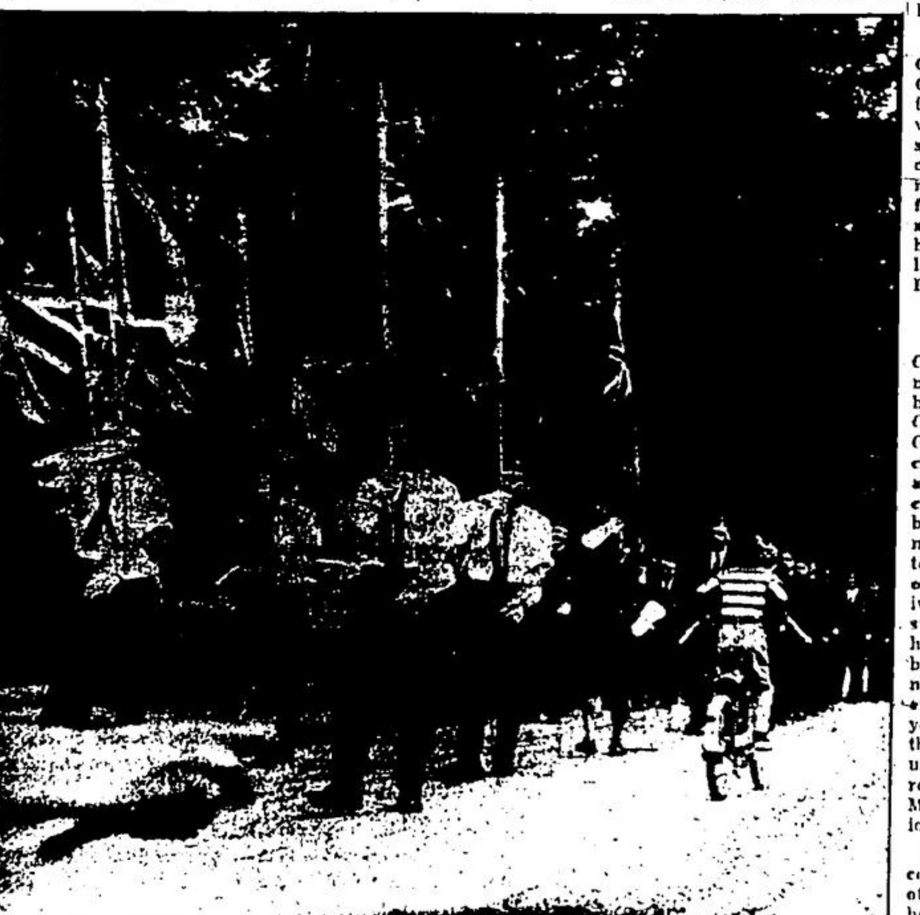
Legionnaires march to cemetery for Decoration Service

Keep June 28th in mind. You could win $250, or one of eight other prizes. These prizes may be won at the Branch Elimination Dance, a limited number of tickets are available.