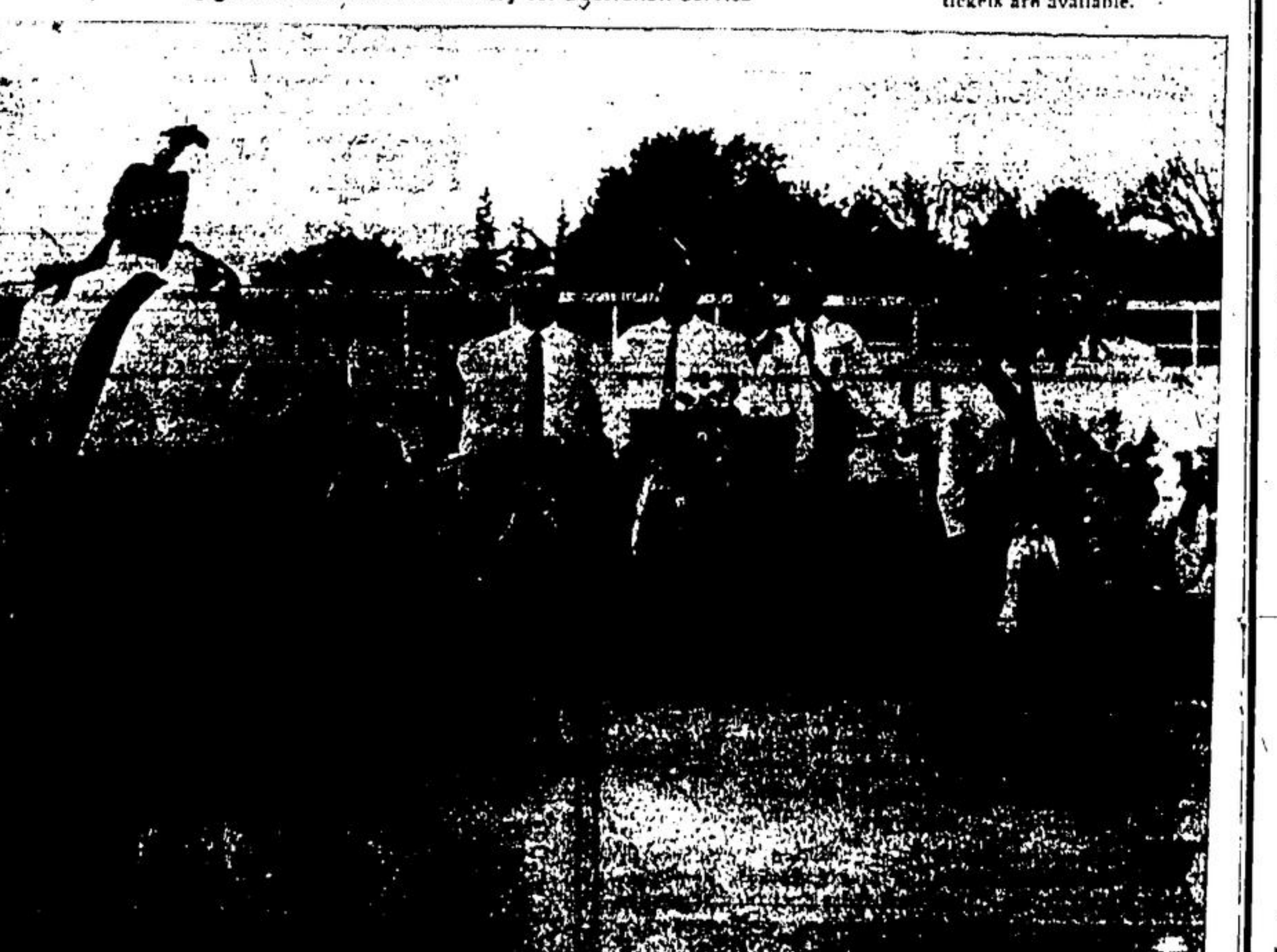
Branch 120's pipe band made public debut Sunday