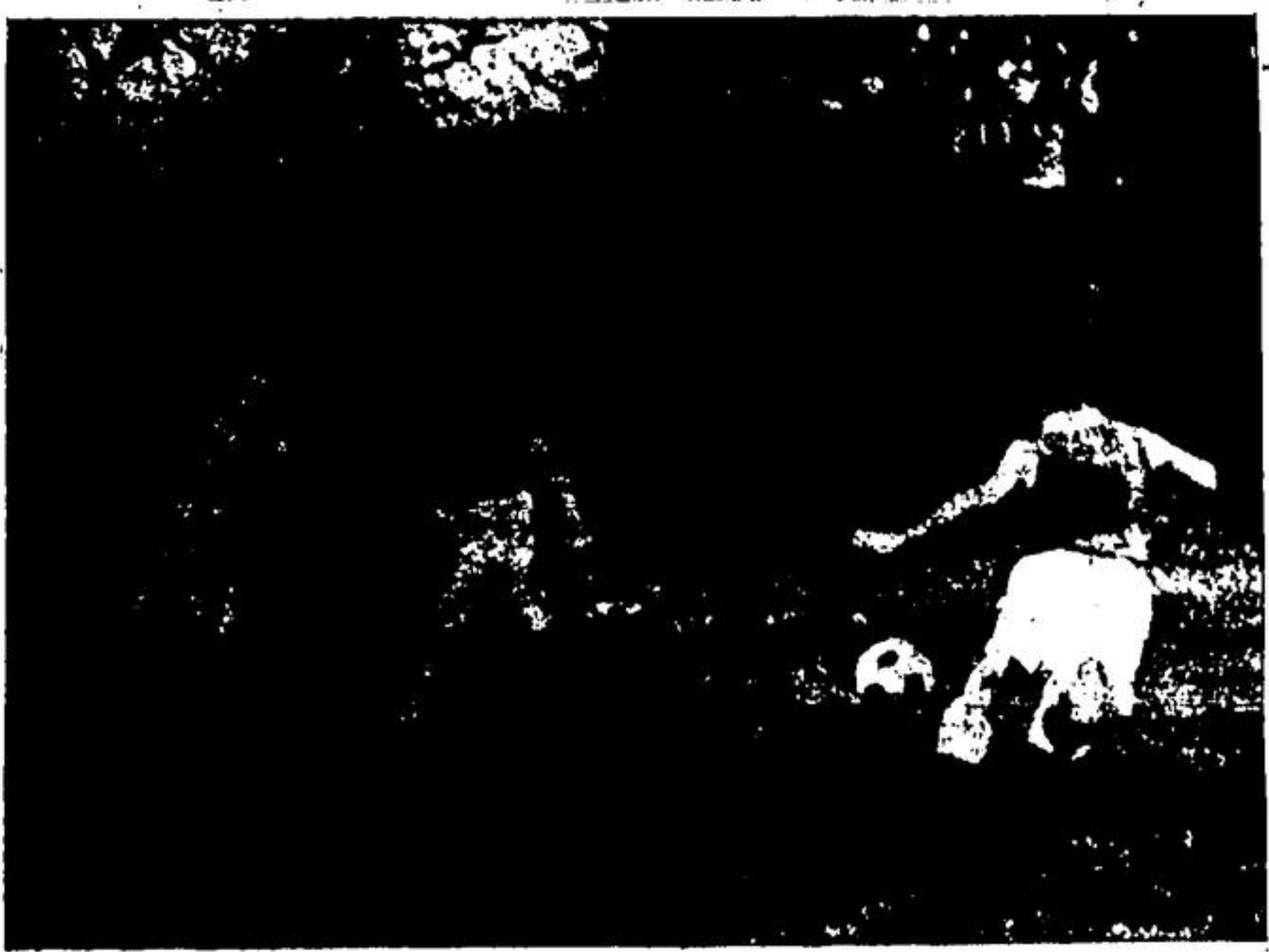
Fast Action in Opening Soccer Match