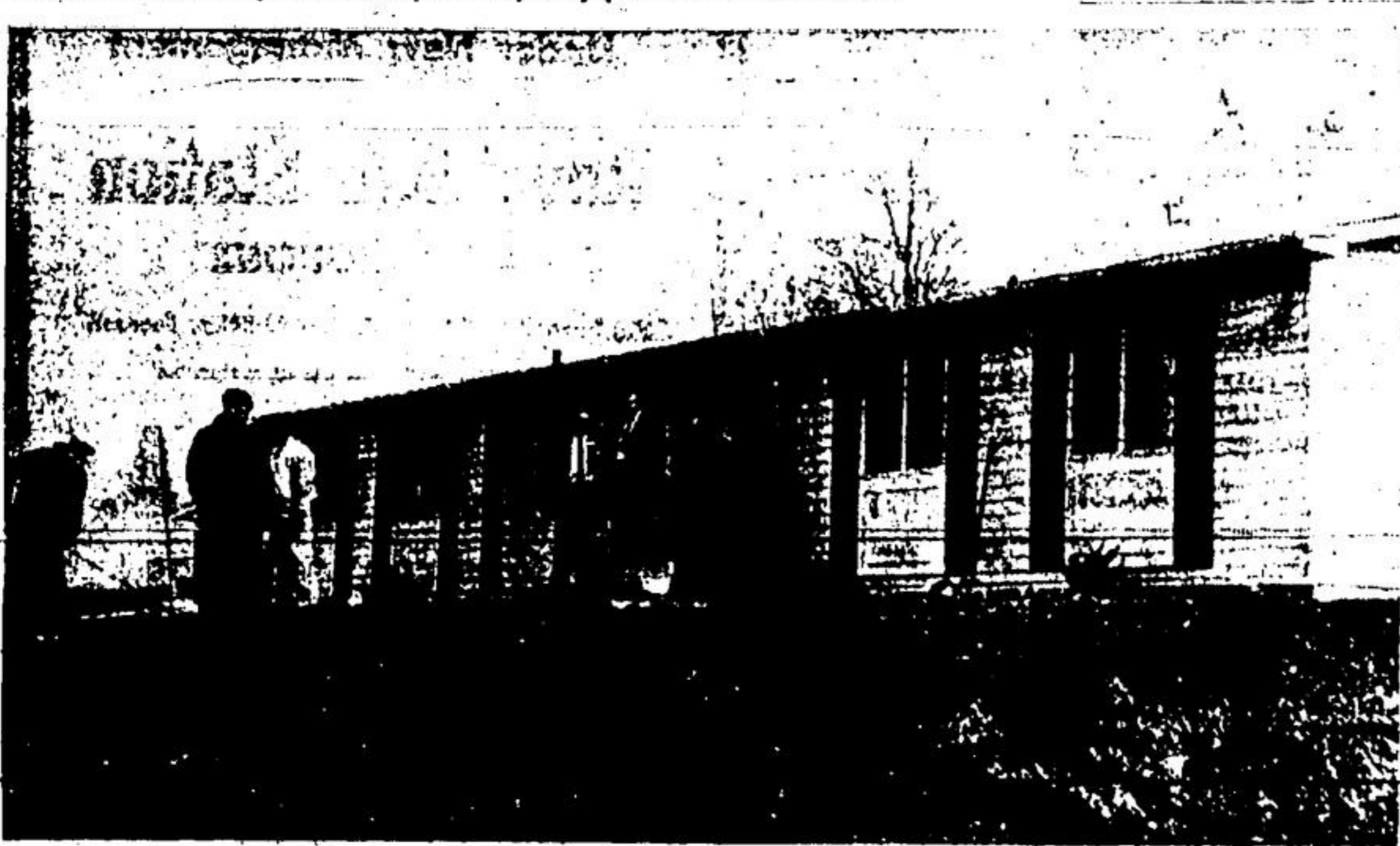
Georgetown councillors exit from an Alcan pre-fab as workmen landscape the site in a Woodstock subdivision