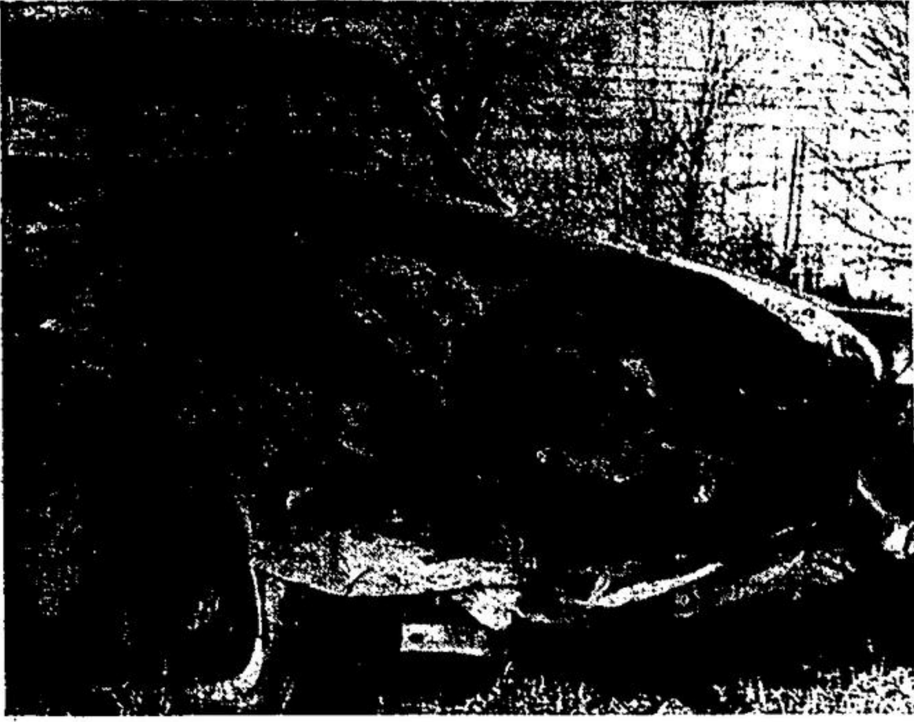
By ignoring the rules your car can look like this . . . . .