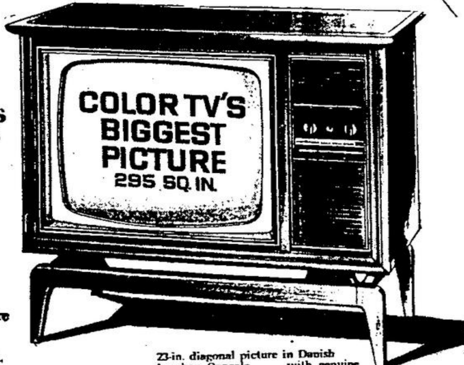
23-in. diagonal picture in Davish Lowboy Console... with genuine Walnut veneers and select hardwood solids with Oil Walnut finish.

SEE OUR FULL LINE OF MOTOROLA ALL-TRANSISTOR TABLE, CLOSET, AND PORTABLE RADIOS