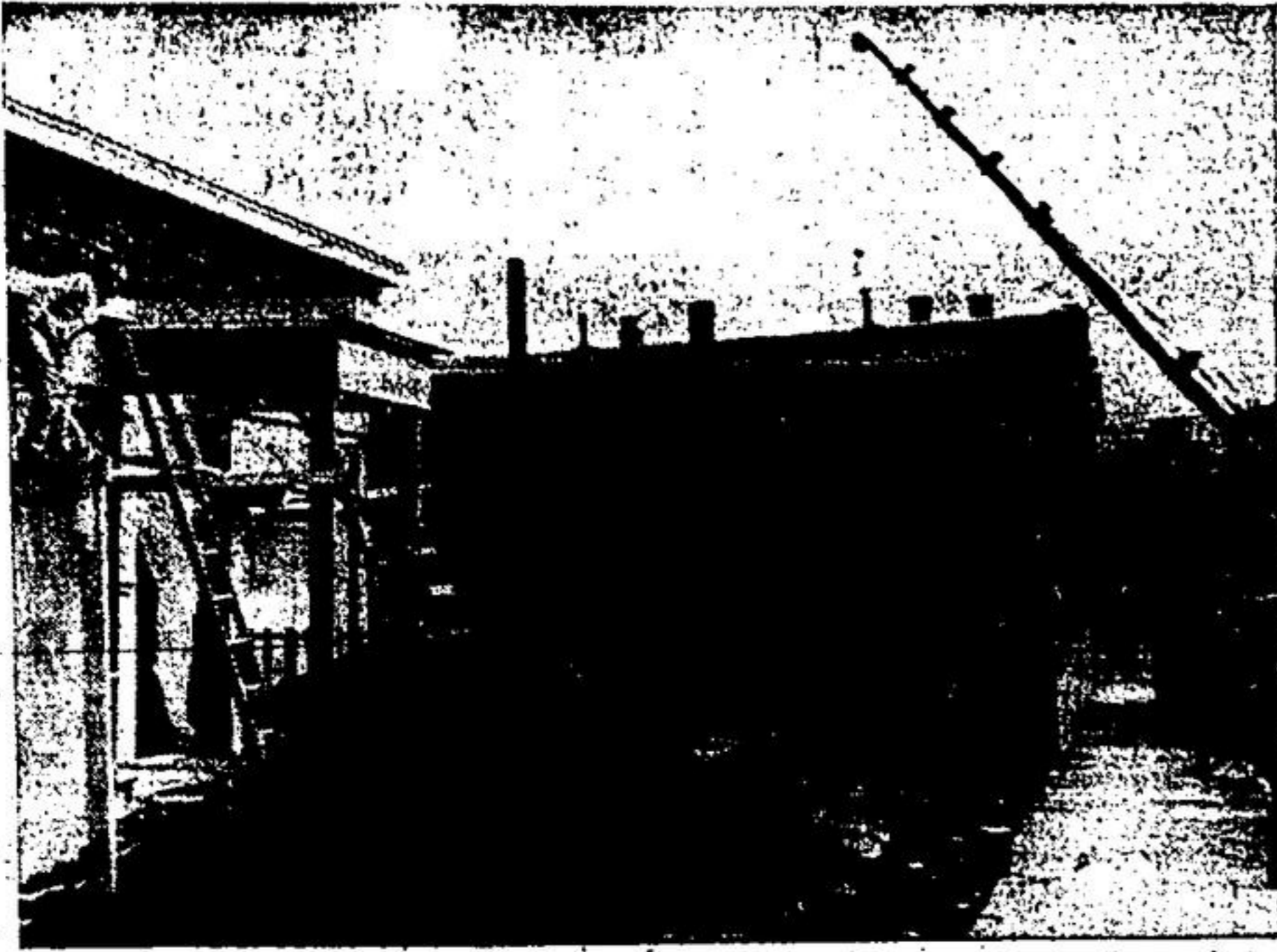
Shoppers downtown are part time sidewalk superintendents these days as construction projects lengthen the north side of the business section. At left, workmen race against the weather to finish the exterior work on the new Halton and Peel Trust building. In the background a crane places a steel beam in the Woodrux commercial building beside Silver's Dept. Store.