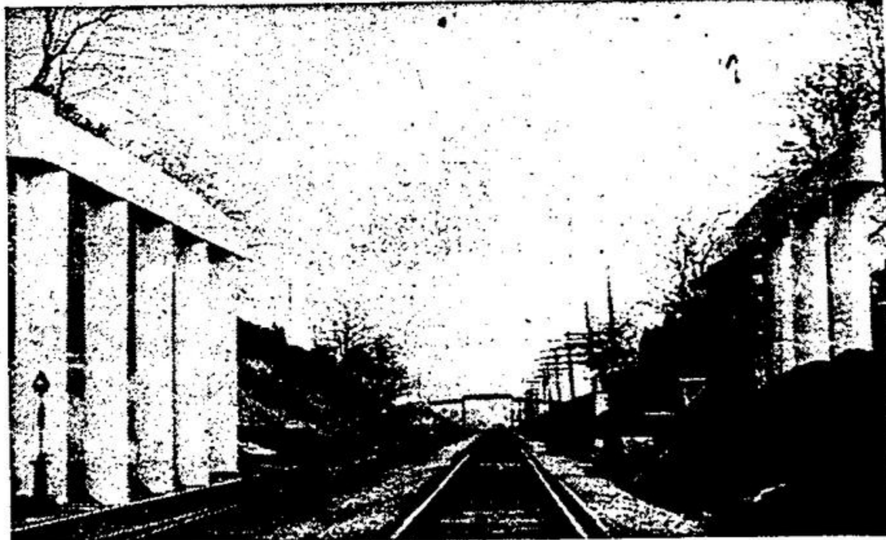
It looks like the ruins of a Roman coliseum, but in fact it's Georgetown's new Mountainview bridge over the CNR tracks. Work started in mid-summer with the grading of new approaches and removal of the old span. Traffic will be using the new overpass before the end of the year.