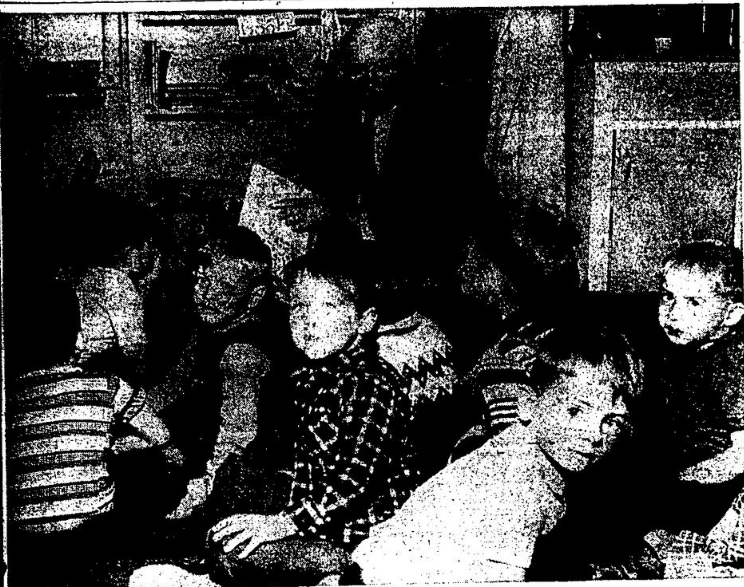
THE CHILDREN'S HOUR

Authorized as Second Class Mail, Post Office Dept., Ottawa, and for payment of postage in cash