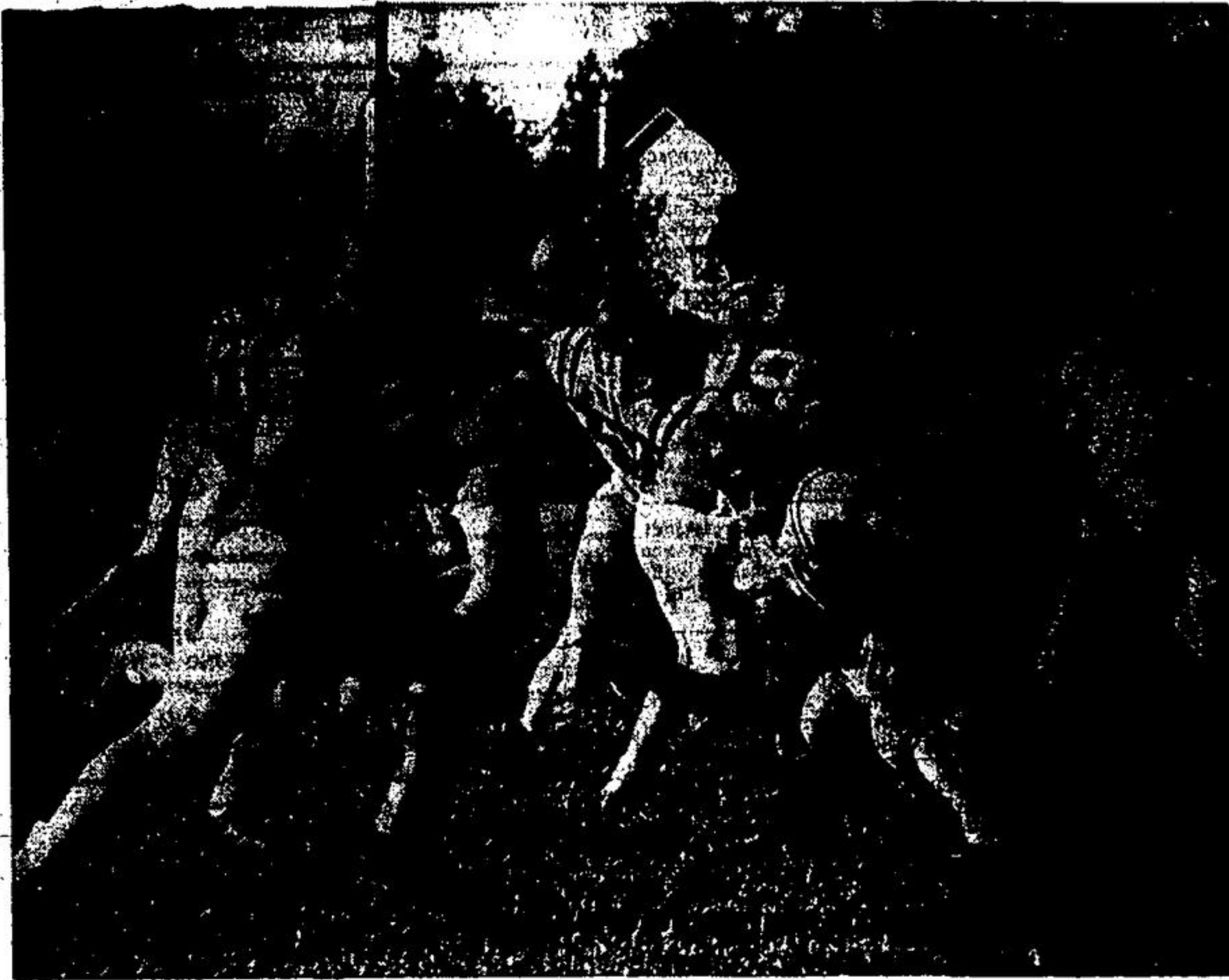
EFFECTIVE RUNNING AND A SOUND DEFENSE added up to Georgetown Rebels first victory of the senior football schedule in Guelph Friday when they knocked off the GCVI Gaels 20-12. Georgetown and Guelph are tied for second place in their league, behind J. F. Ross seniors.