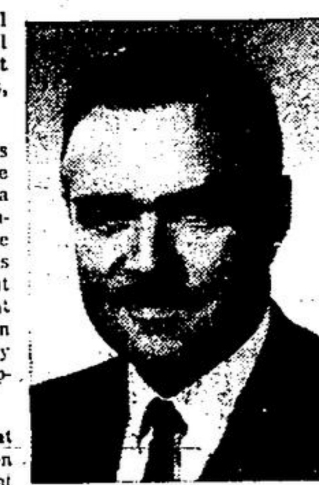
PREMIER JOHN ROBERTS in Halton East

"It may be taking a long time to put it into action, but then it has to be in effect for a much