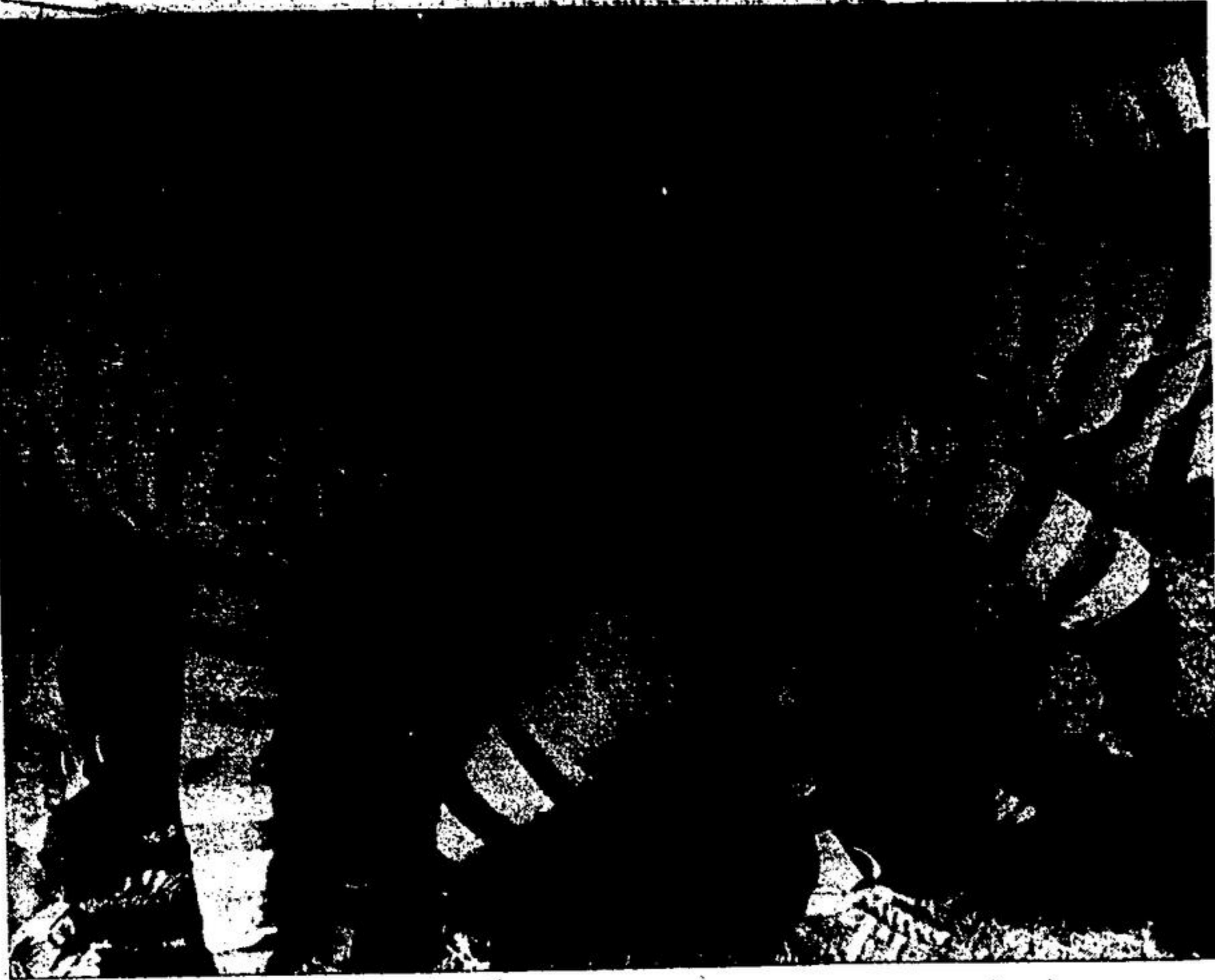
IT'S A SCRUM CHUM

IF YOU'RE NOT A RUGGER BUFF this tangle of limbs could pass as the latest in the never-ending series of teenage dance. If you are a rugger buff you know it is a 'scrum,' one of the ways in which the ball is put into play. The players in striped jerseys are Georgetown Beavers. The locals, entered in the International League with Buffalo, N.Y., Brantford, St. Catharines, Hamilton, and Kitchener have a record of two wins and a loss. Their next home game is October 1st in the park where Hamilton will provide the opposition.