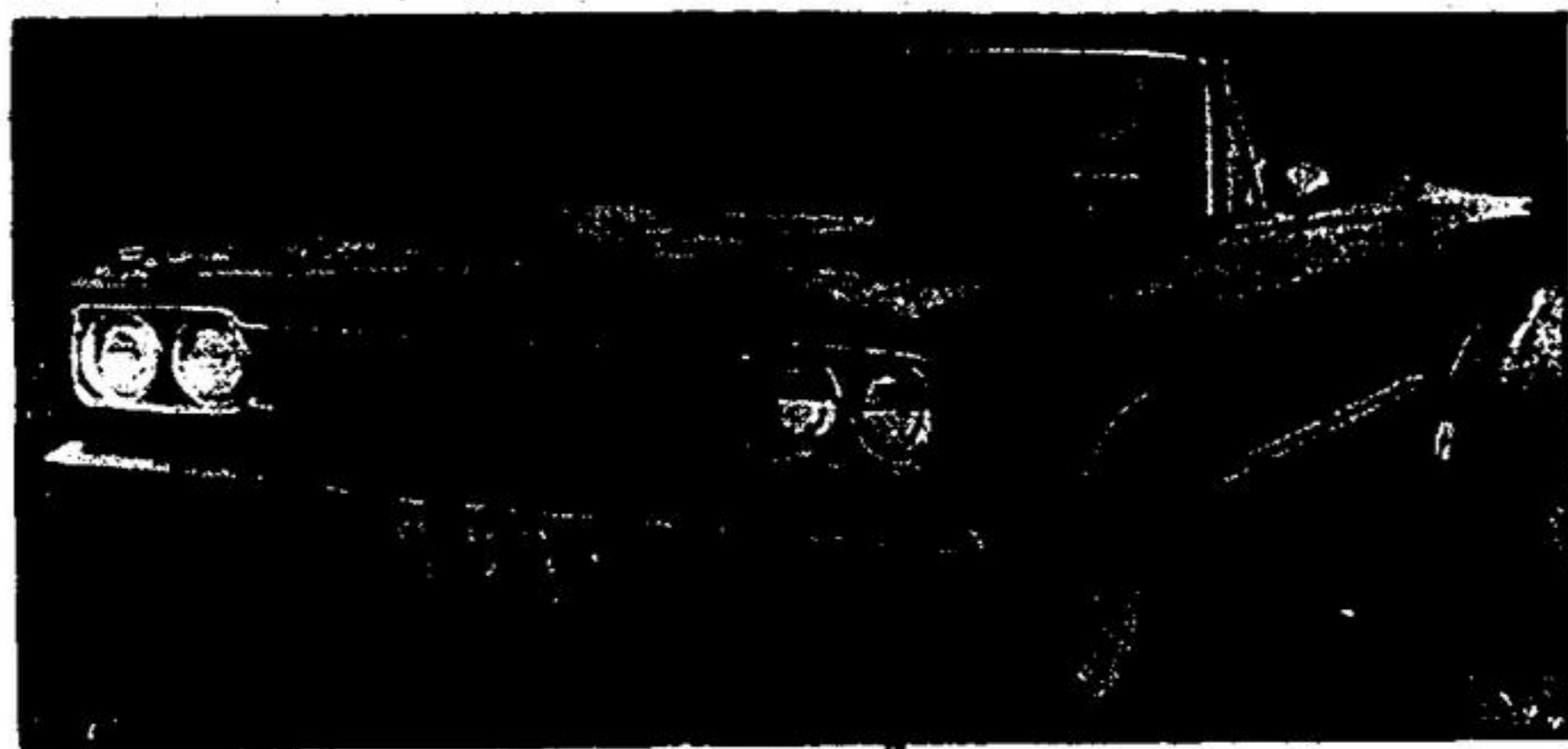
1968 PLYMOUTH GTX