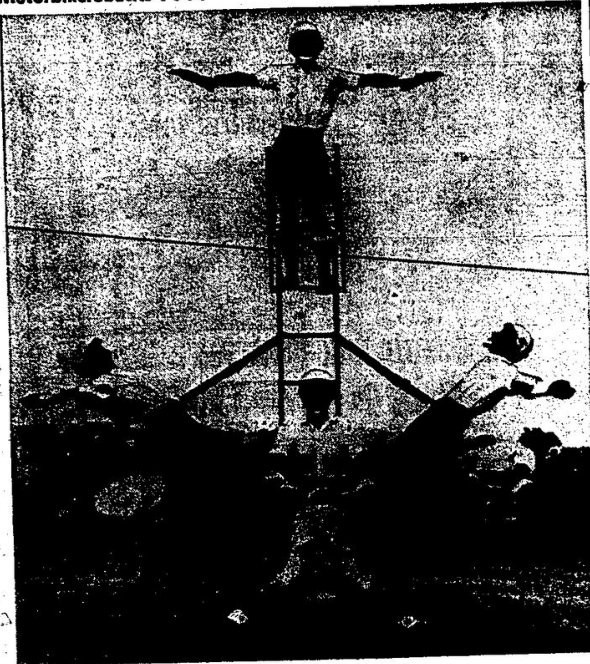
HUMAN PYRAMID ON SINGLE MOTORCYCLE