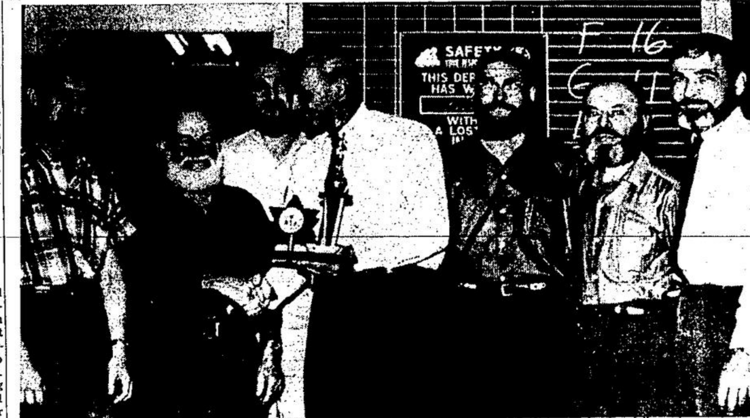
WHISKER CROP WORTH AWARDS

Win By The Hair of Their Chinny Chin Chins