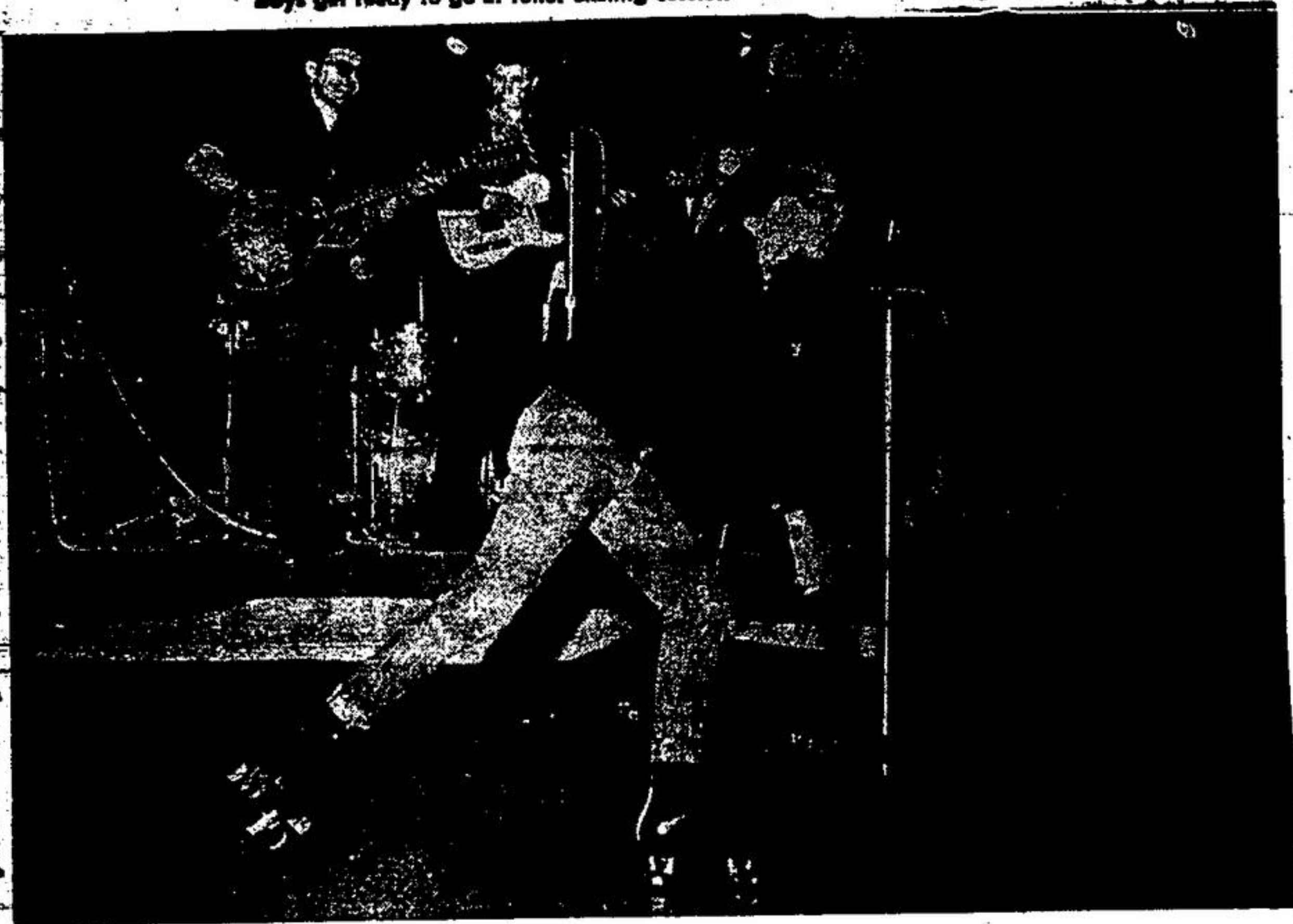
Live Bands have proven a big hit with the skaters