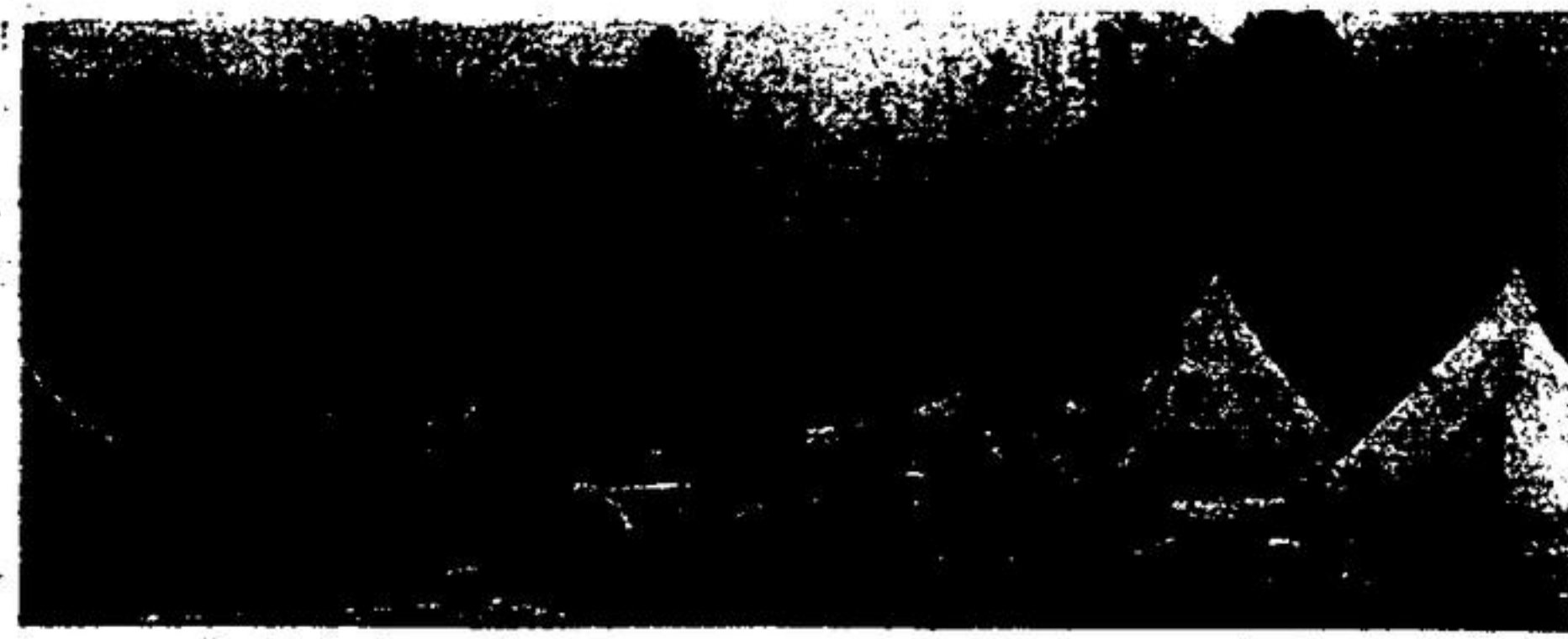
District Cub Camp campsite