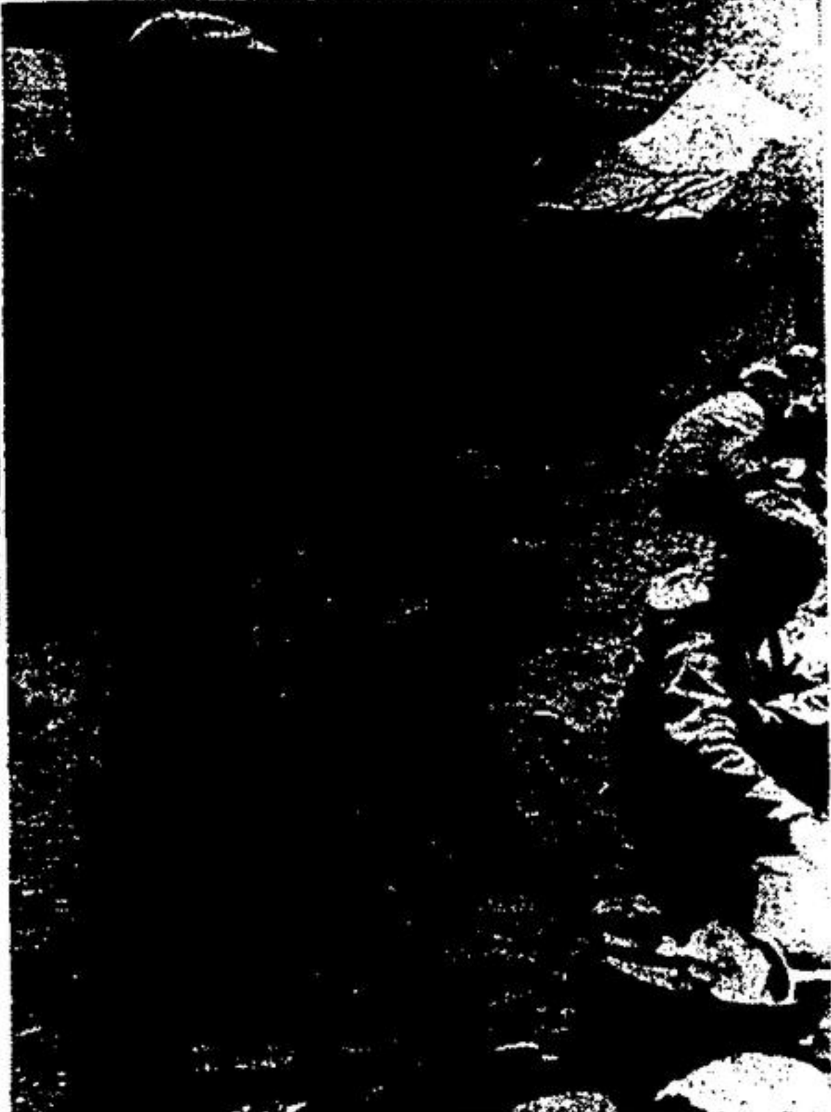
The Cubs learned cooking skills

of the camp was to introduce some of the cubs who will be elevated to Scouts next year to some of the Scouting camping methods.