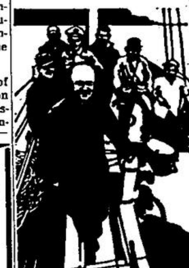
M.V. Notre Dame de l'Esperance at Moosonee

The Trail to Arctic Tidewaters On an Arctic Tidewater Adventure Vacation, to Moosonee and Moose Factory Island, you'll rub shoulders with Indians, Eskimos, traders and prospectors from a thousand miles around Hudson Bay. At Ontario's last frontier, you'll taste the flavour of a pioneer past and sense the prospect of a nation's great future. On your way from North Bay to Cochrane—departure point for the fabled Polar Bear Express—you can swim, fish and boat in Ontario's most beautiful tree-fringed lakes, visit world-famous gold mines and gigantic wood-pulp mills, scratch hopefully among Cobalt's abandoned silver workings. Comfortable accommodation and well-serviced campsites are always near, along smooth, easily-travelled highways. An Arctic Tidewater Adventure Vacation will thrill your family to their very bones. Would you like to have more information? Just mail the coupon, today.