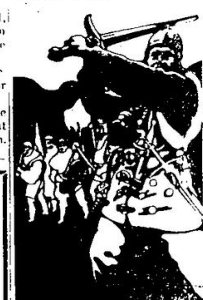
Enjoy dramatic triumphs at Stratford Festival

Land between the Lakes An Adventure Vacation in the Land between the Lakes will lavish you with the golden fruitfulness of the land, with cultural jewels and a wealth of entertainments.