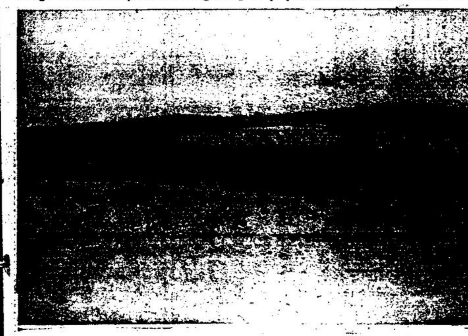
Yoder Equipment plant on Todd Road