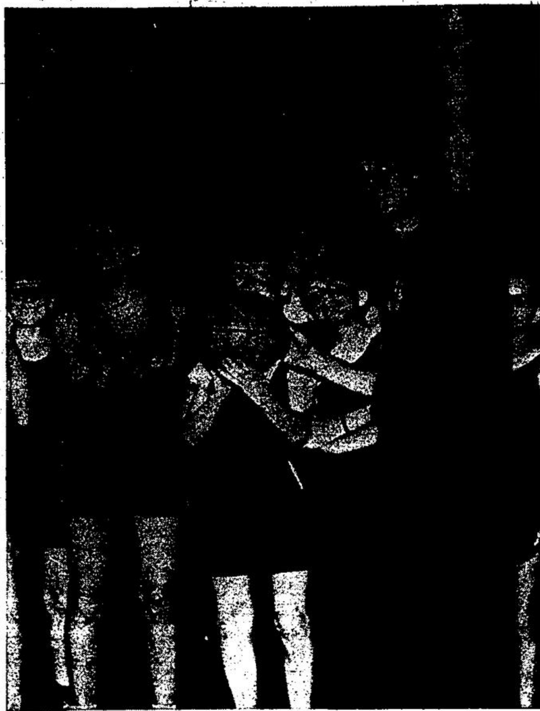
"THAT'S THE BALL AND THERE'S THE BASKET"