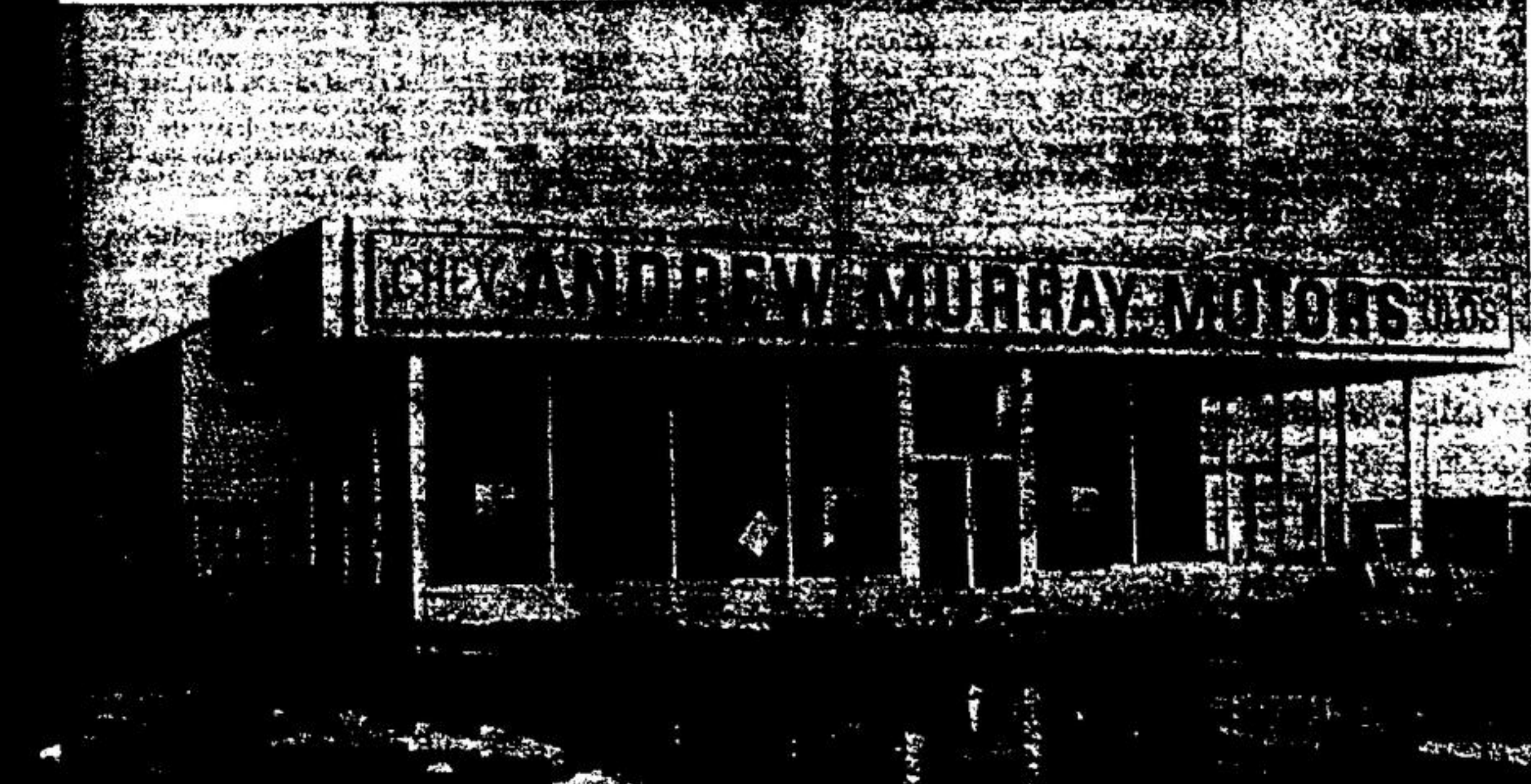
15,000 SQUARE FT. BUILDING on Mountainview Road will soon house showrooms, garage, and body shop for Andrew Murray Motors. It's on the western edge of the Industrial Park.