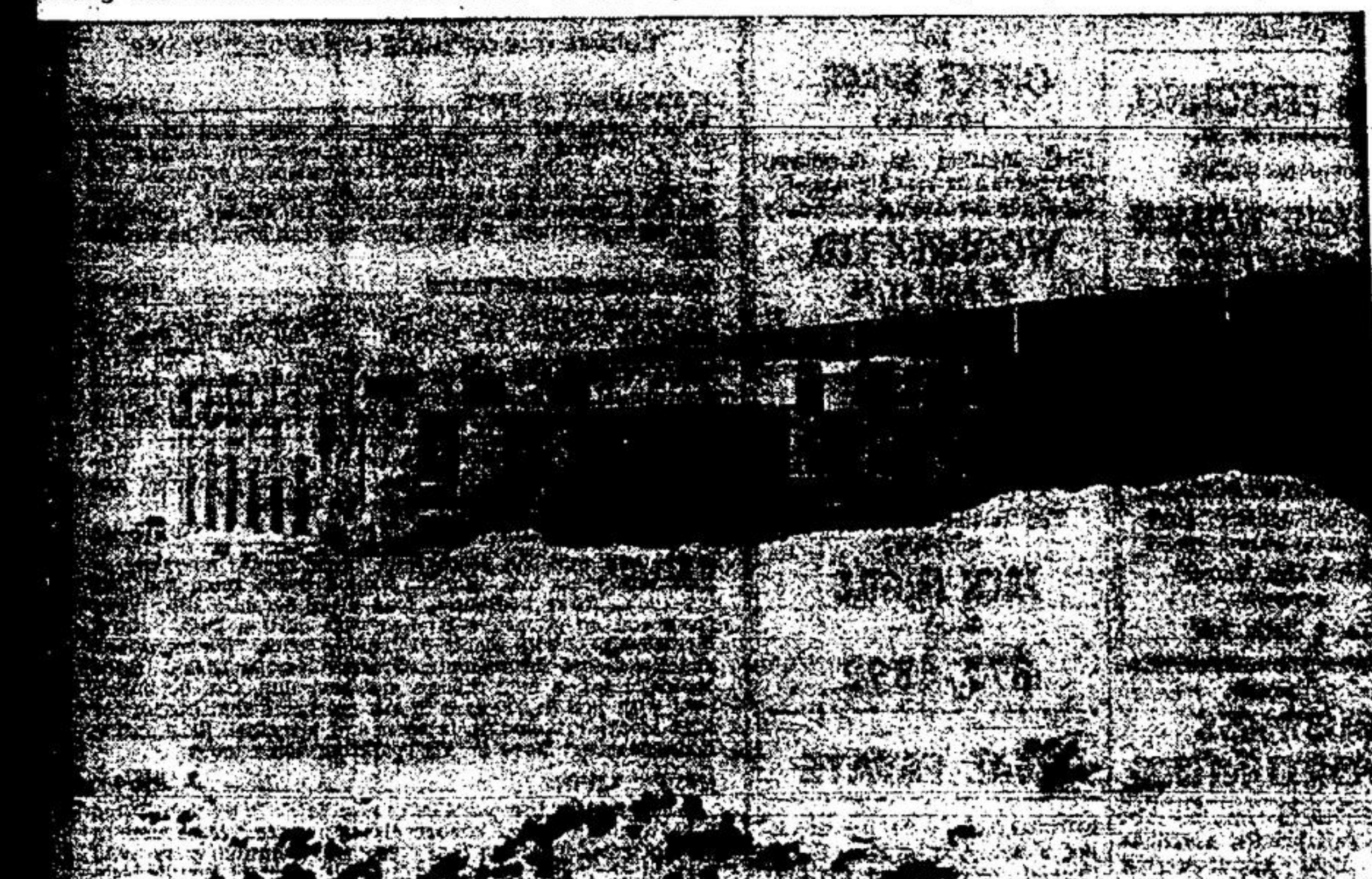
MOST RECENT TO START OPERATIONS is this Dennison Manufacturing plant, also on Todd Road. The firm, which turns out paper specialties such as crepe paper, streamers, gift wrappings, stationery items, etc., commenced distribution operations here about three weeks ago. The plant area is 35,000 square feet.