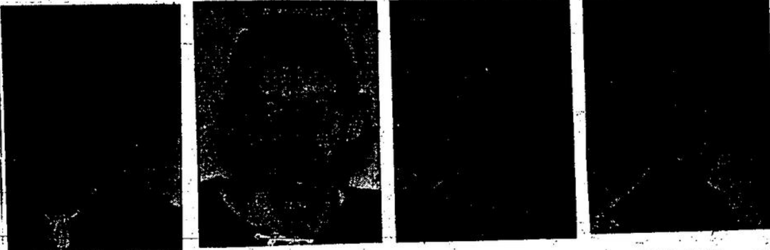
JIM BLAIR "Flyin'"