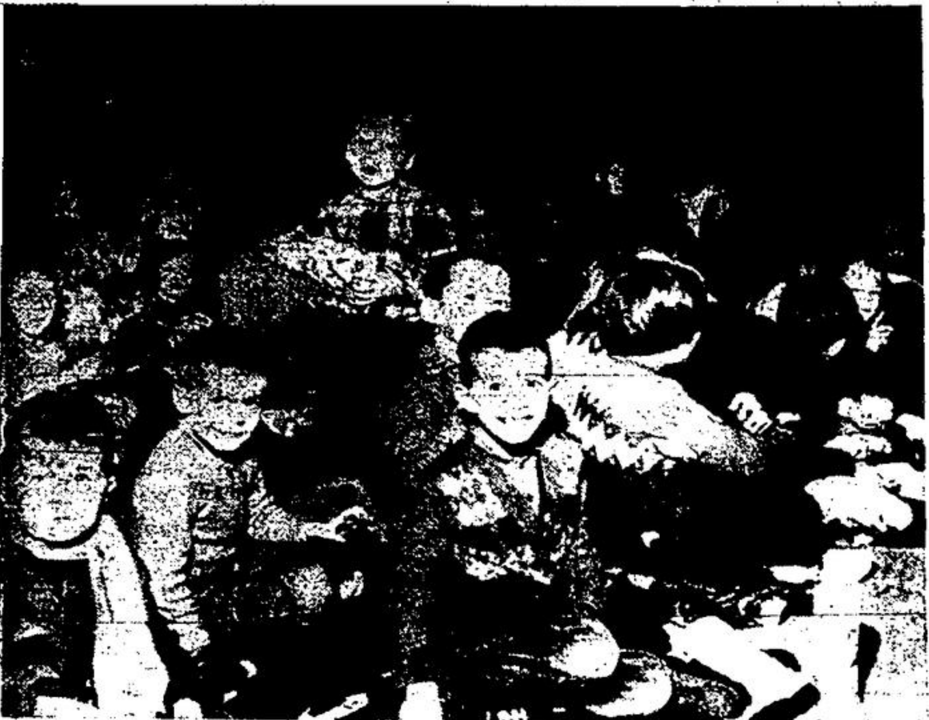
Well stocked with something to munch during the film, the matinee audience is ready for the show to start.