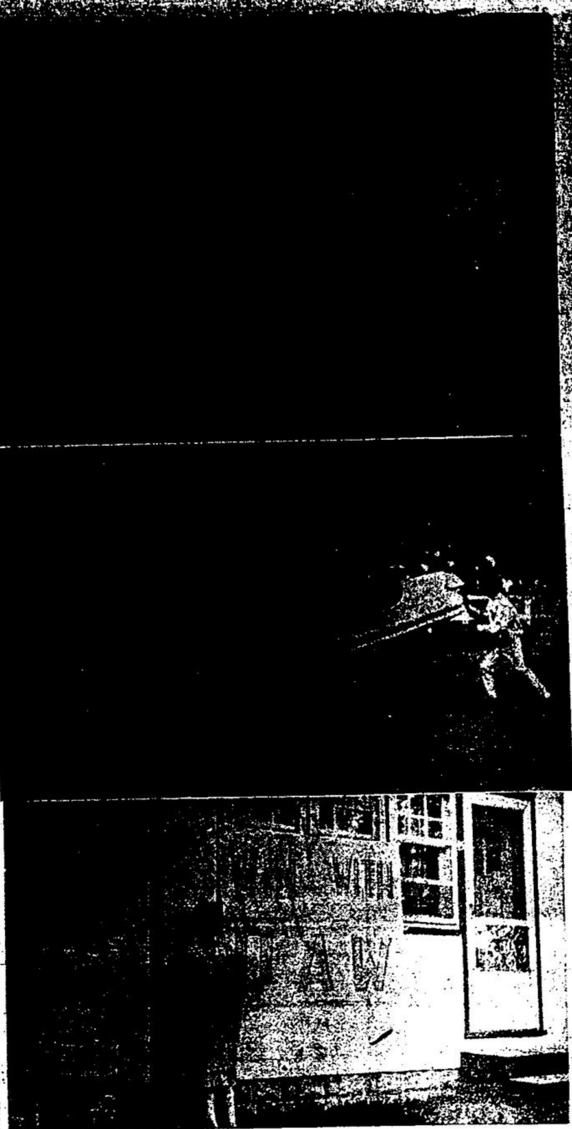
THE OLD YEAR IN PICTURES TOP LEFT: The cutting of a ribbon across a wooden bridge at the entrance to the Cedarvale school property officially opens the town's centennial project. CENTRE LEFT: Large crowd thrills to death-defying stunts during rare appearance of Hell Drivers in town park. BOTTOM LEFT: Campaigns like this one culminate in success as town's largest work force, the Smith and Stone Local, change unions voting in favour of United Auto-Workers. TOP RIGHT: Residents stand for countings as a team of twenty census takers canvass town and district in the Dominion census. BOTTOM RIGHT: Sacre Coeur church is founded to serve the French-speaking community.