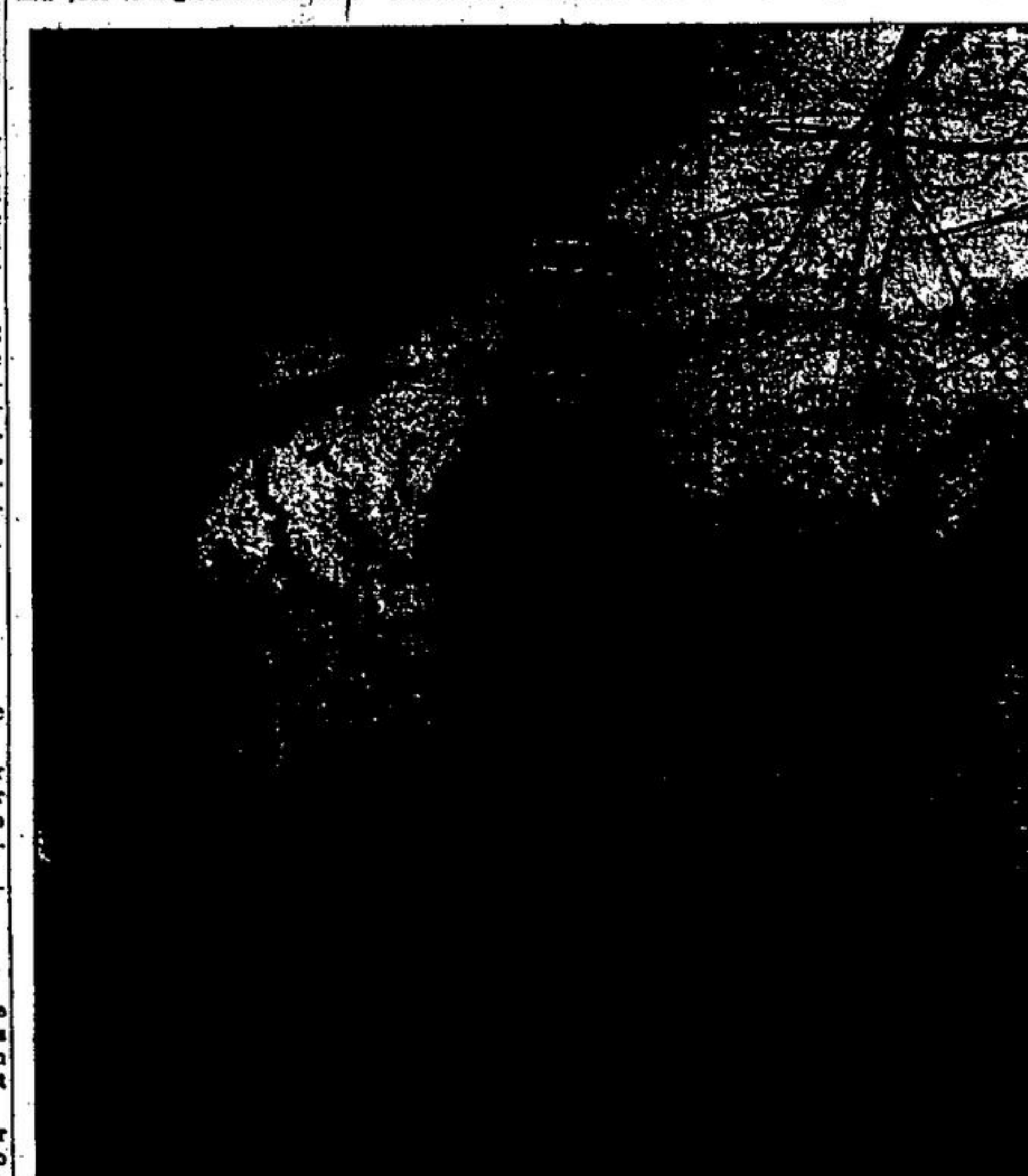
Wesleyan Street furniture factory goes up in smoke.

In its 40-odd years, the building has been a blacksmith, tin smith shop, auto body shop and garage, farm implement shed and wood products factory.