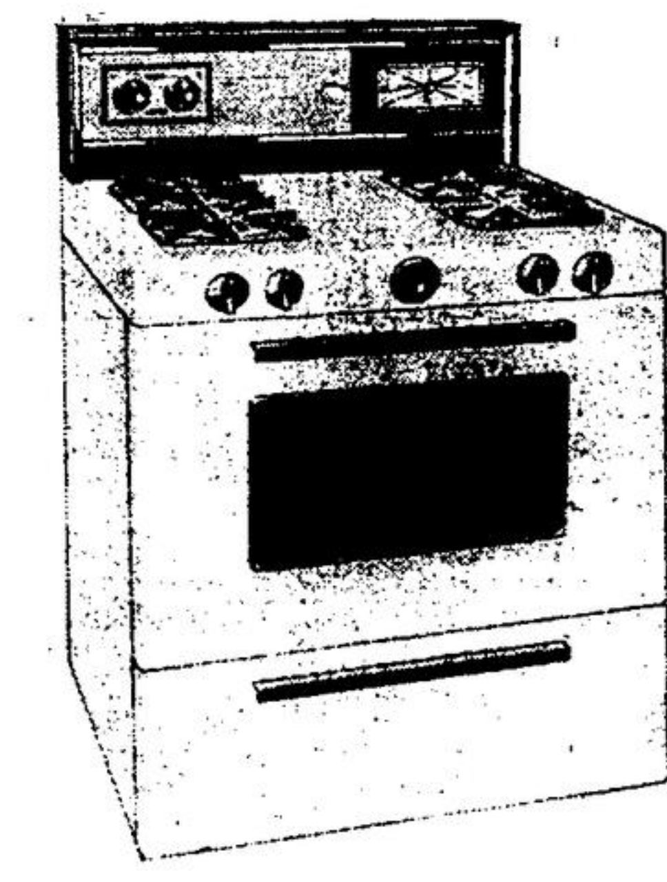
MOFFAT, FINDLAY, TAPPAN - CURNEY, ENTERPRISE, BEACH.

In addition, you have a chance to get a modern gas dryer for as low as $199.95, no down payment, or as little as $4.35 a month on your regular gas bill. Each quality gas dryer is gentle enough for any fabric, and a must for permanent press garments. Only a gas dryer gives you complete circulation of warm air, at a speed that leaves clothes fresh and wrinkle-free and what a big difference in operating cost. Take advantage of the special low prices on these gas dryers now.