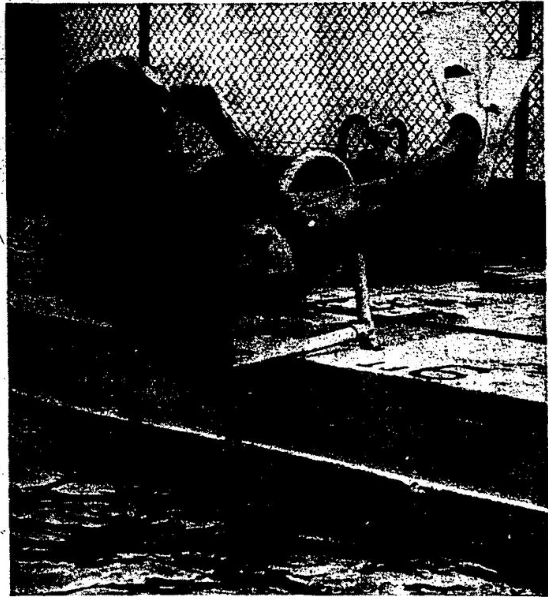
FOX DEMONSTRATES THE PROPER METHOD of entering the water while wearing SCUBA gear for the Herald photographer.