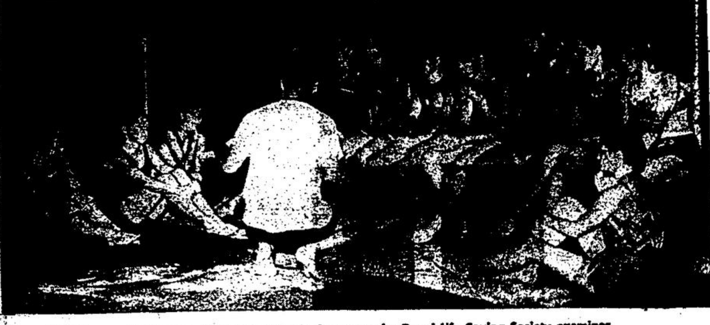
Bronze Medallion candidates are given the difficult theory test by Royal Life Saving Society examiner.