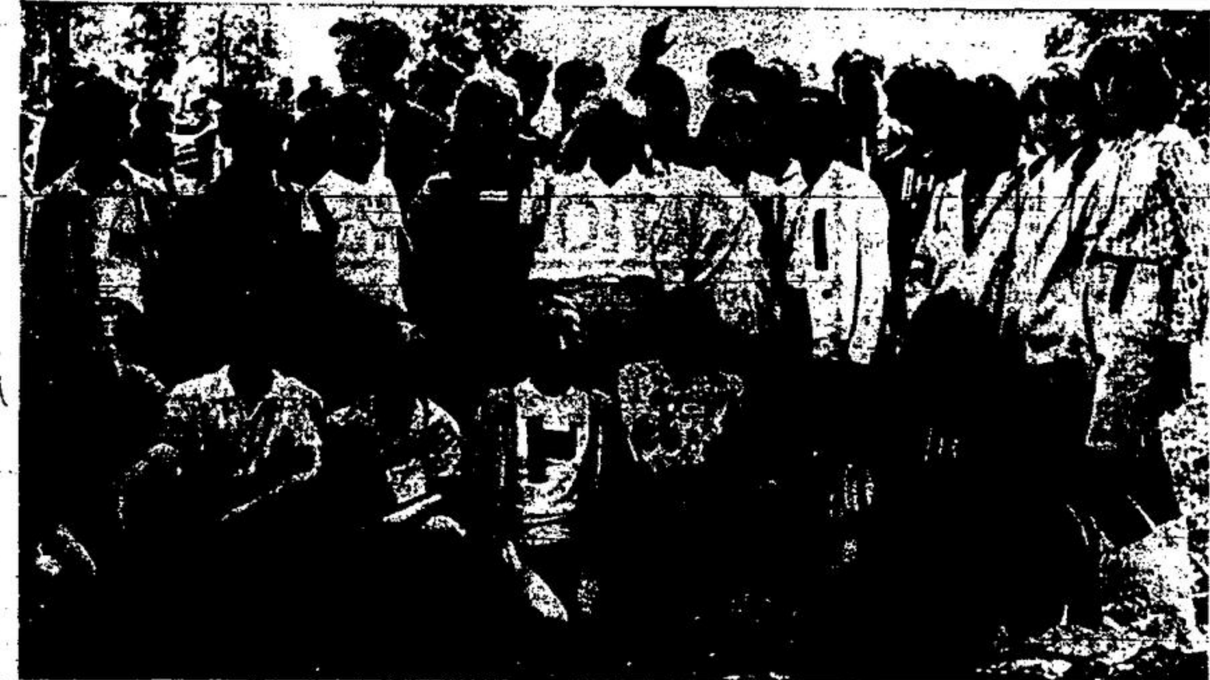
These young athletes earned first place ribbons.

Wrigglesworth Public School athletes captured the Georgetown Public Schools Field Day for their school by running up a total of 63 1/2 points in track and field events in the park on Friday, June 10th.