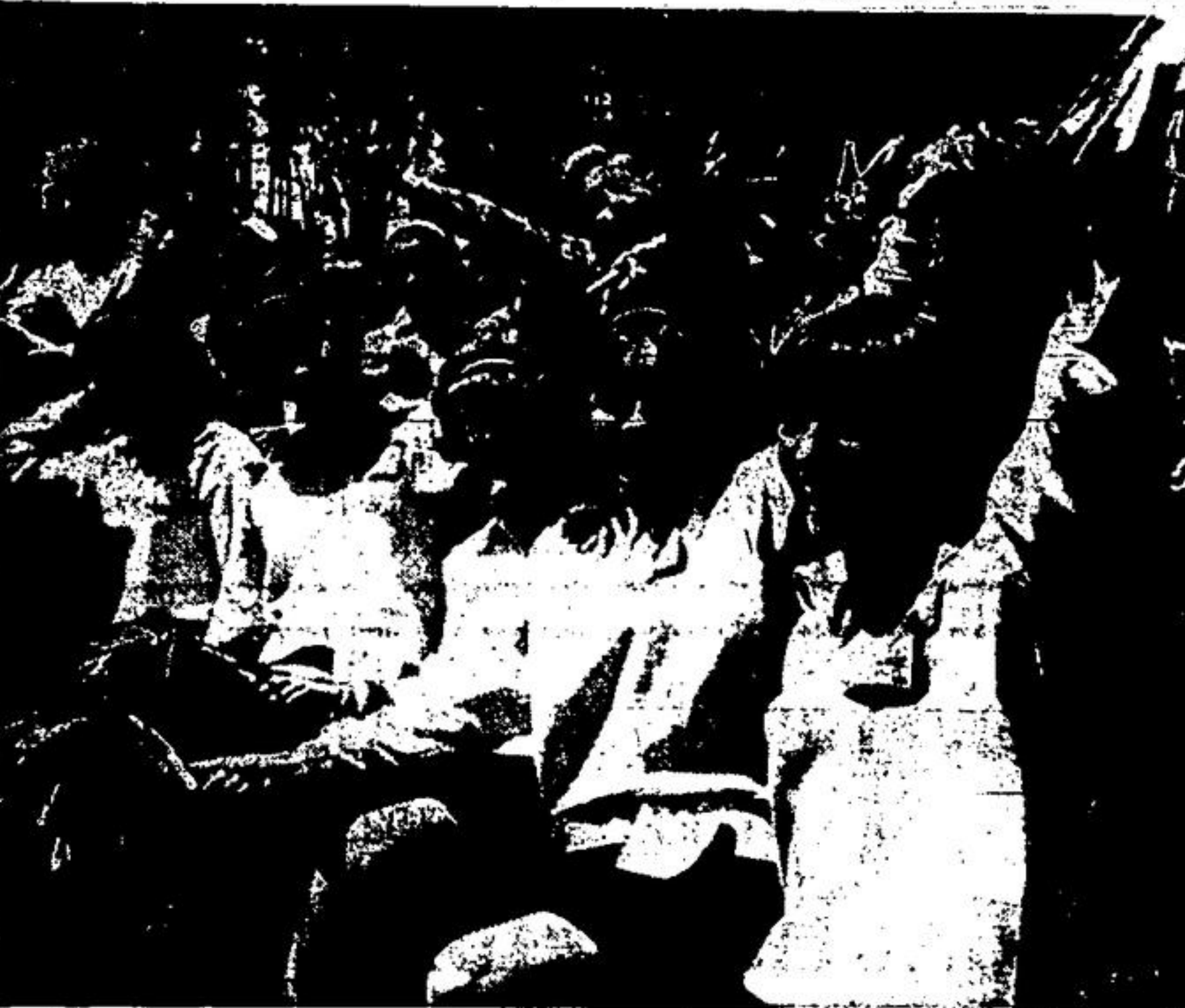
George Kennedy Public School cheerleaders yelled their team to second place.