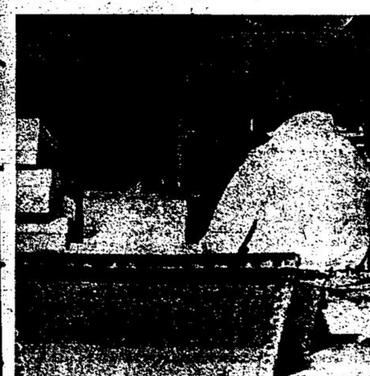
GUESTS FROM "DOWN UNDER" listen intently to an explanation of how the Dominion Seed House operates during a tour of the local industry.