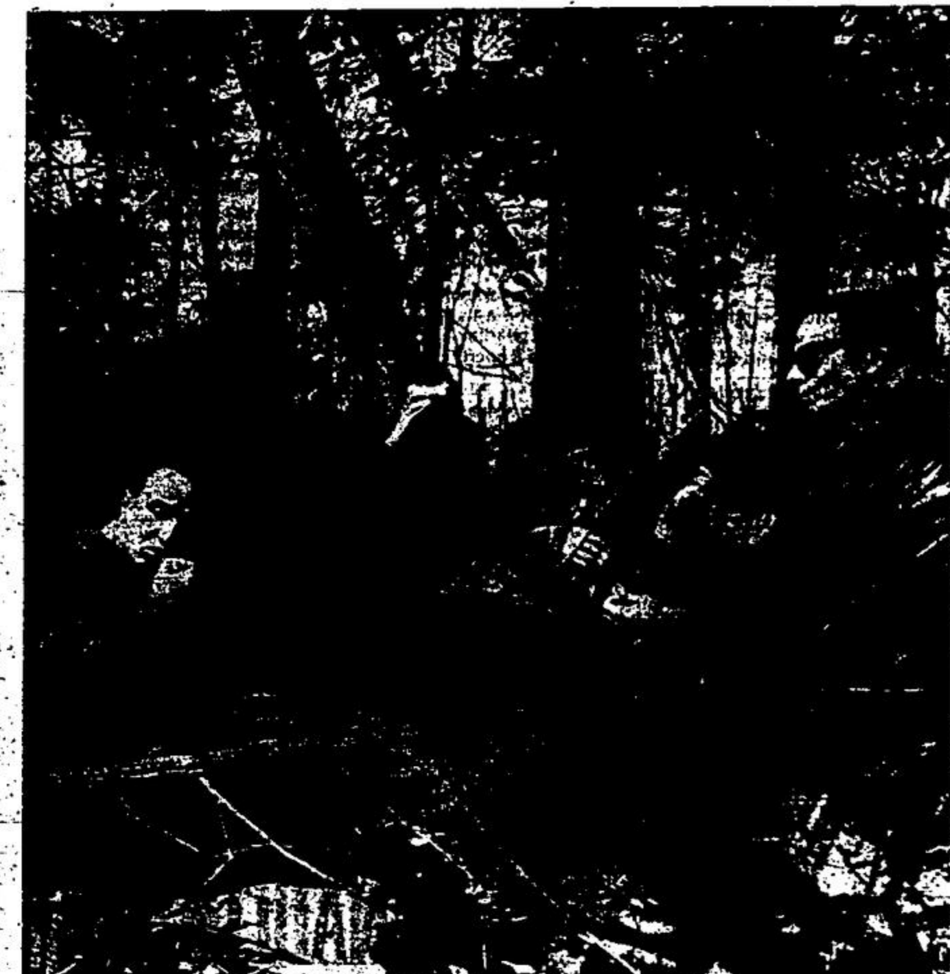
LUNCHES NEVER TASTE BETTER THAN THOSE eaten by hikers while on the trail. This foursome taking time out for a bite of lunch agrees wholeheartedly. There were 17 hikers in the group that trekked the trail in the Georgetown area recently.