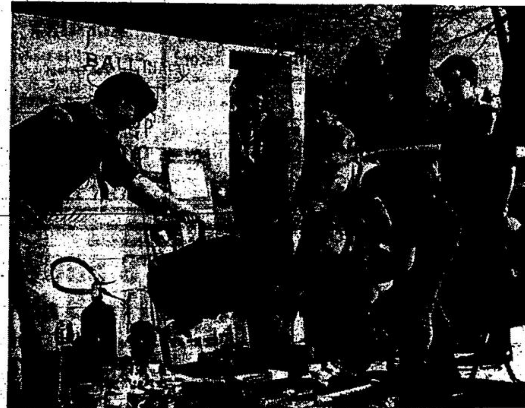
THE SCOUT MOTTO is 'Be Prepared' and it was significant that their part of the day consisted of demonstrating ways of doing just that. Here the 1st Ballinfad Troop stress being prepared to survive nuclear fallout. They built the simulated shelter in front of which are all the items a well-stocked shelter should contain. A good sized crowd made up mainly of parents of the participating boys visited the park to inspect the show. Denny Lewis of the Ontario Scout executive and 60 Cubs representing two Brampton packs also dropped around.