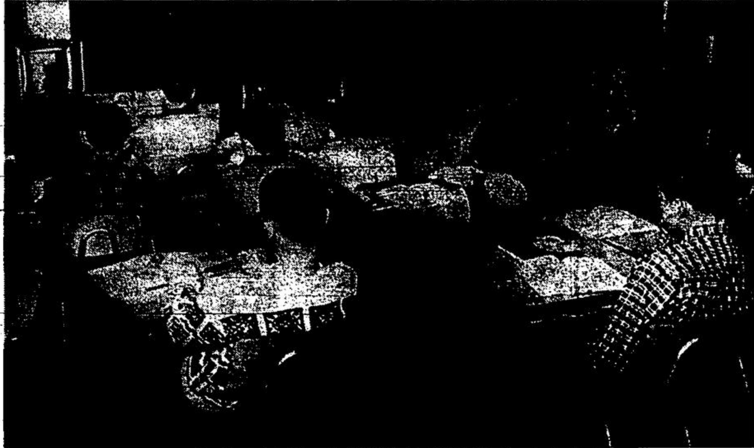
THE VIEW FROM THE BACK OF THE ROOM shows the new maths being flashed on the television screen in large numerals as pupils take note. The television receivers are used to relay other educational programs to the local senior grades as well as the 18-part new maths course.

EDUCATIONAL TELEVISION IS NOW PART of the week for pupils at Georgetown public schools where the new maths course is being explained in series beamed from Toronto and Hamilton stations. Here pupils of Park Public School's grade eight class concentrate on the latest addition to the classroom.