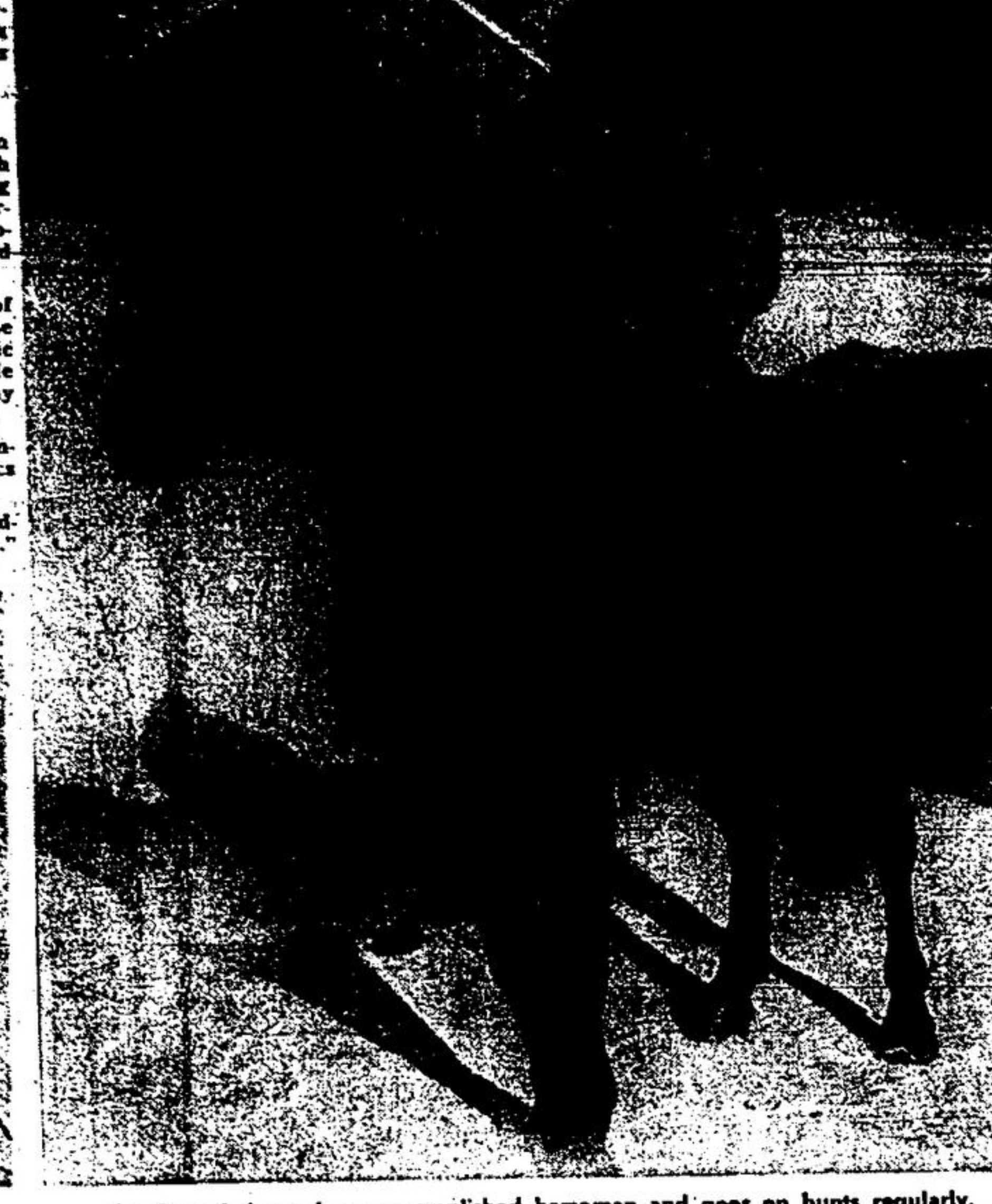
The Commissioner is an accomplished horseman and goes on hunts regularly.

The Brigadier calls his home here "Rolling Hills Farm."