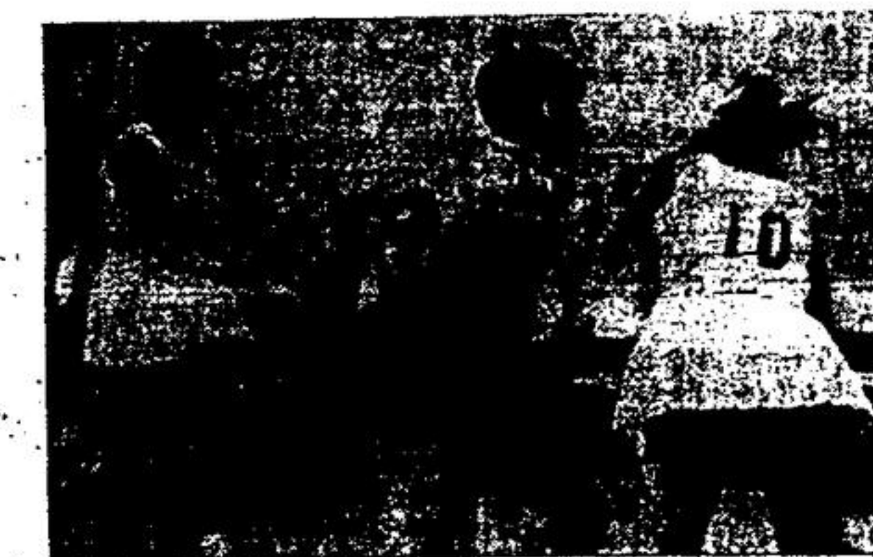
A GCVI player is checked.

The Rebel season record is now 3 wins and 3 losses. They hope to improve this when they meet St. Jerome's and Milton this week.