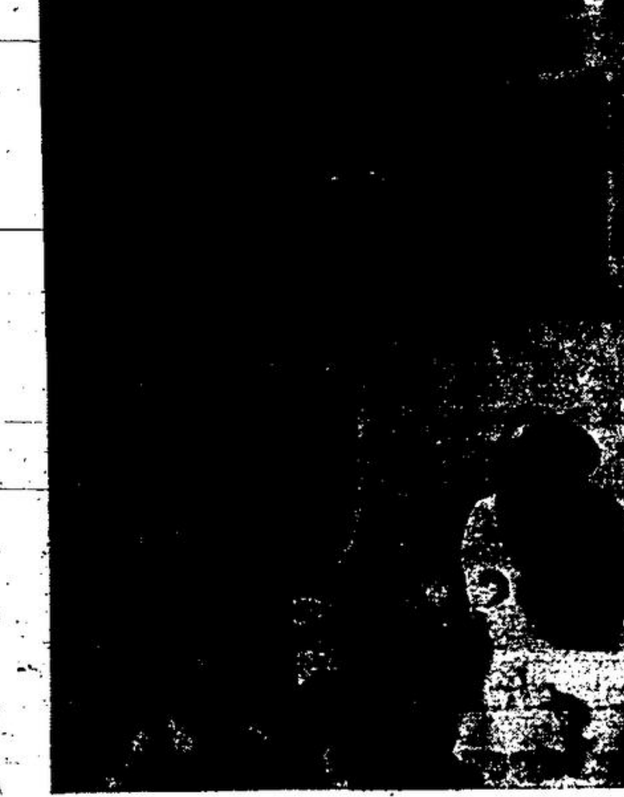
Red and blue wins the jump.