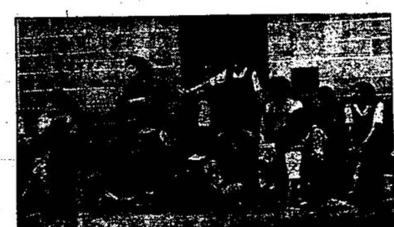
Georgetown senior girls basketball team discusses strategy.