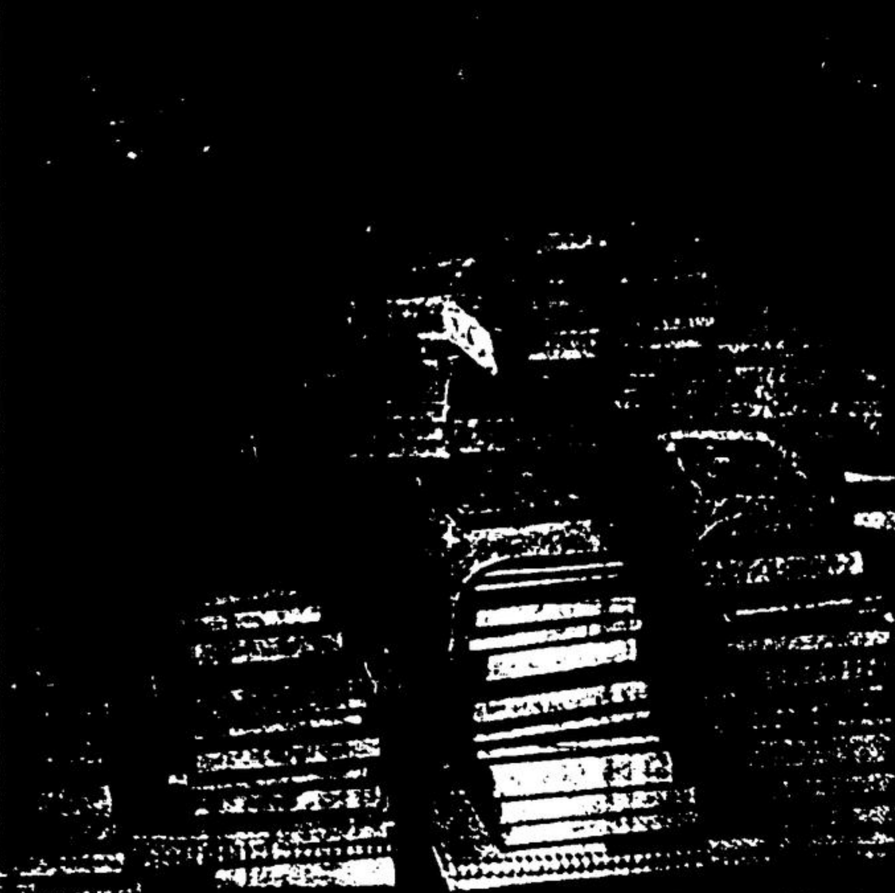
THE OLD YEAR IN PICTURES