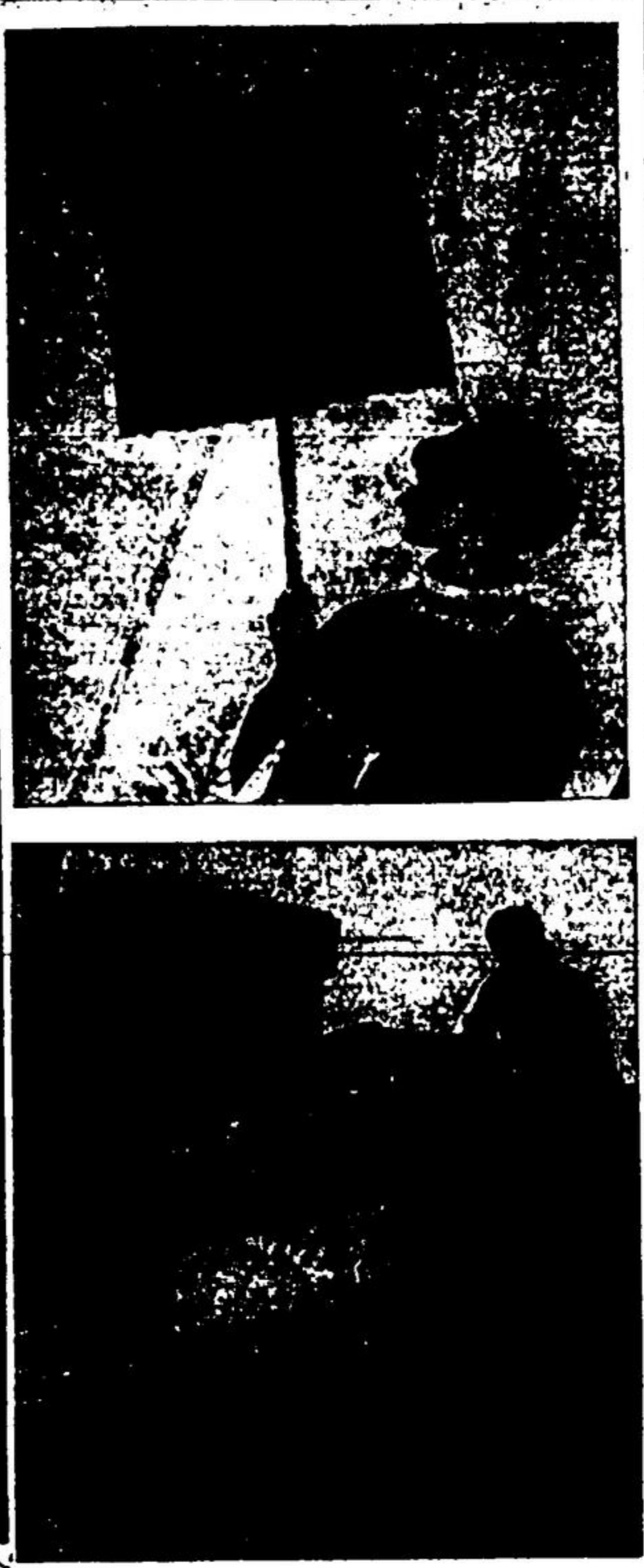
THE OLD YEAR IN PICTURES