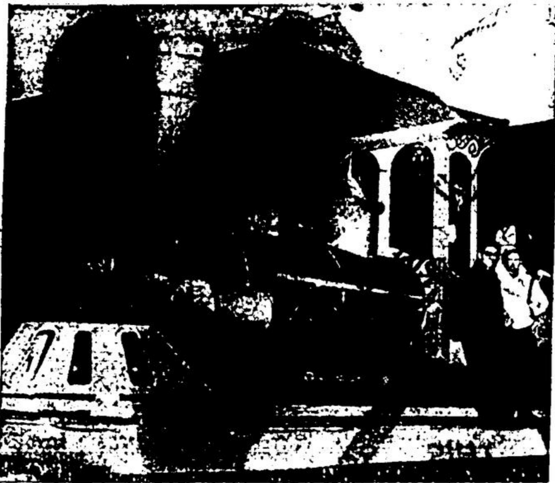
A HIT WITH THE PARADE CROWD was this colourful puffin entered by United Gas.