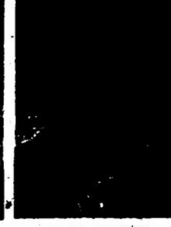
E. W. BIRKLEY