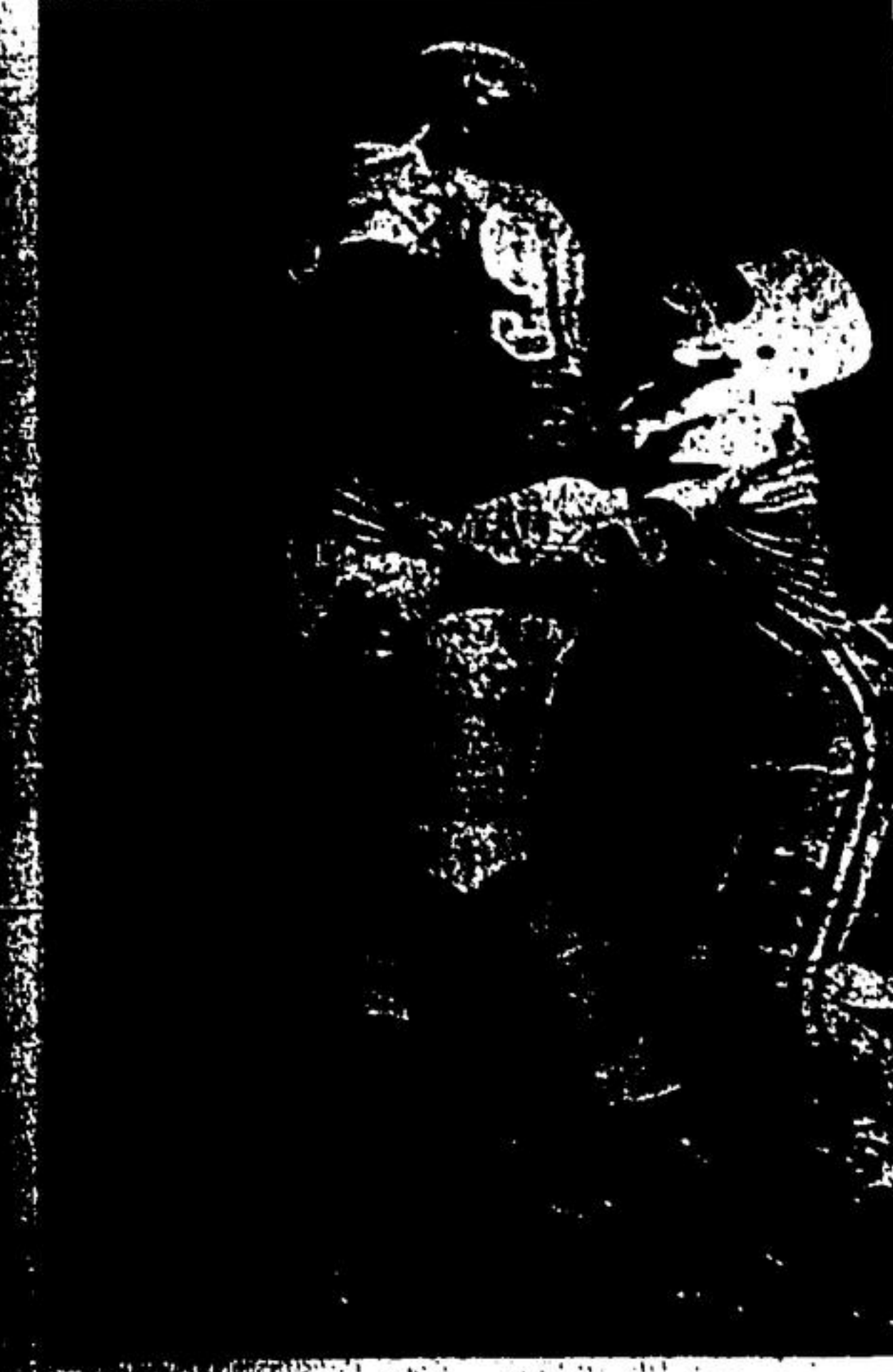
The Rebel jumps to catch another pass. His running and blocking will ODHS opponents this season and carried him to the league scoring crown.