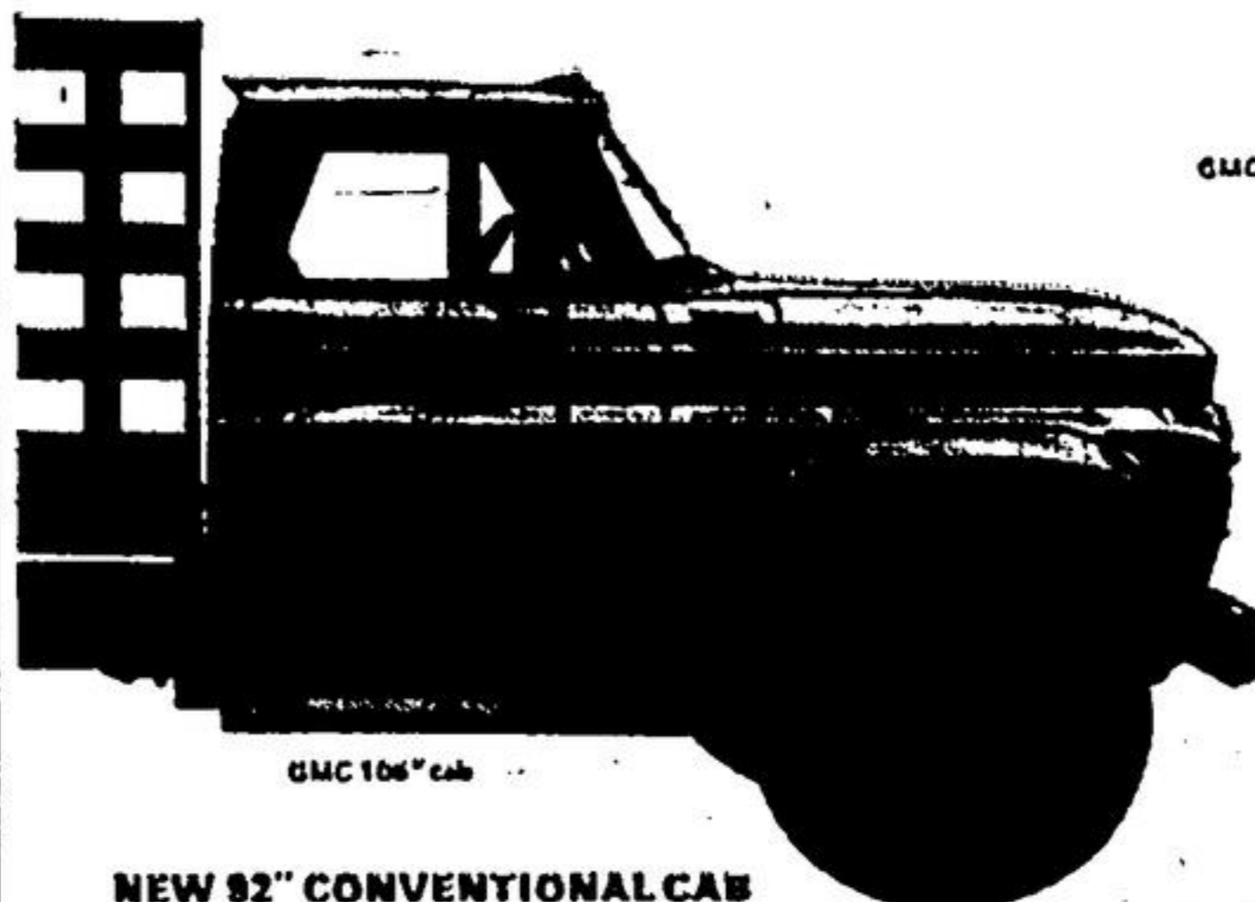
GMC 106 cab

For 1966, a new in-line 6, a new V8 and 4 new V6 gasoline engines join the GMC line-up. Compact V6 block with short-stroke over-square design cuts friction and heat loss to a minimum.