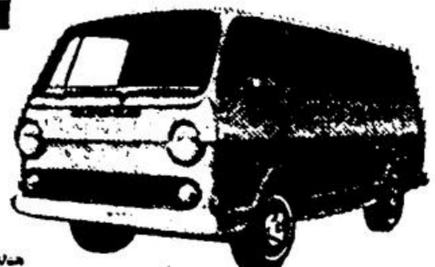
GMC 1500 V8

with NEW Toro-Flow Diesel Engines! NEW V8 Gasoline Engines! NEW 82" Cab! NEW models!