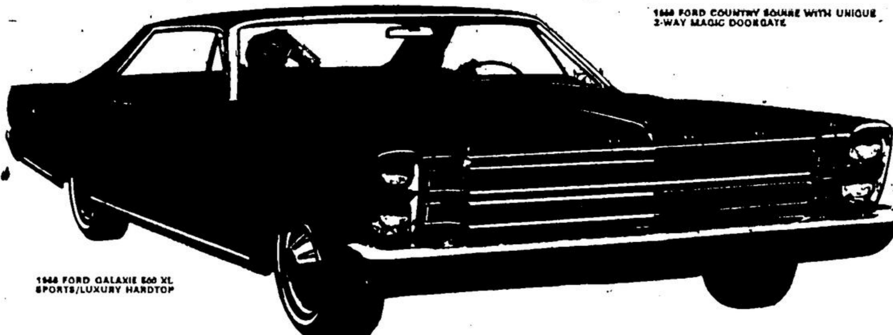
1966 FORD GALAXIE 500 XL SPORTS/LUXURY HANDTOP

The 1966 Ford is the quietest ever...it may be the quietest car in the world. It has a new stronger body...new big V8 engines...economical Big Six power...new high-performance 7-Litre models...new Magic Doorgate on wagons. Take a test drive—listen to the sound of quality.