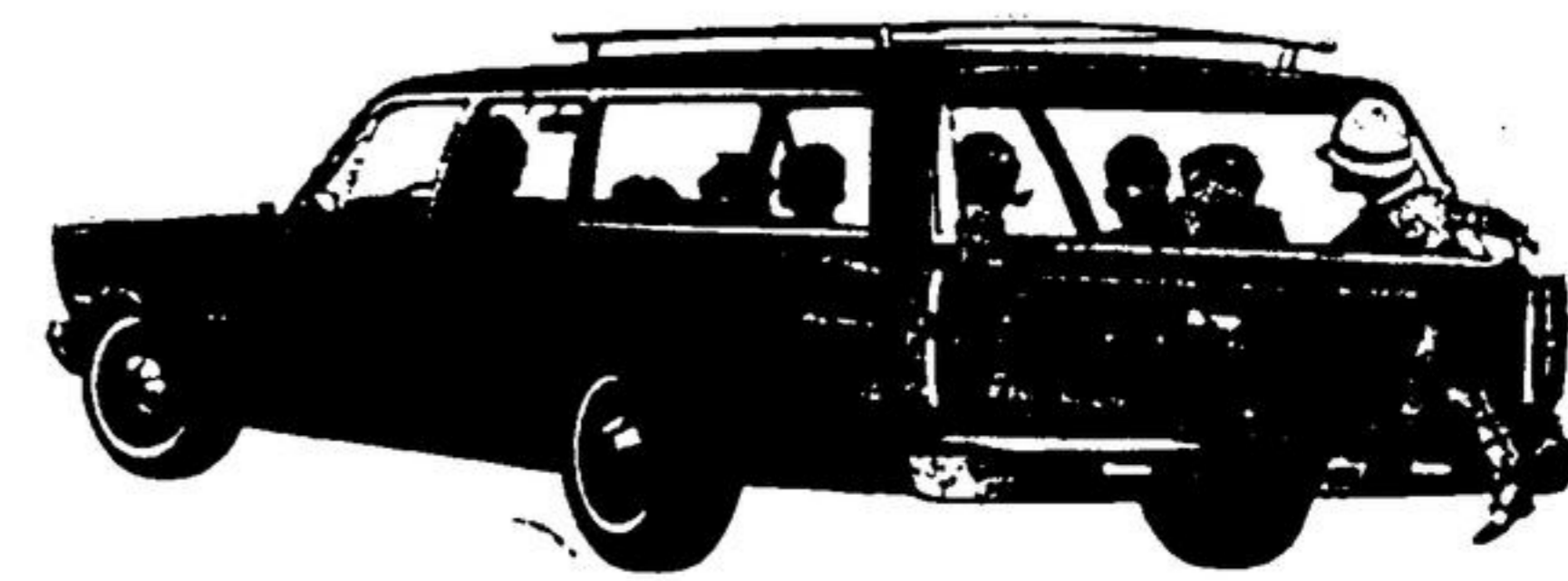
1966 FORD COUNTRY SQUARE WITH UNIQUE 3-WAY MAGIC DOORGATE