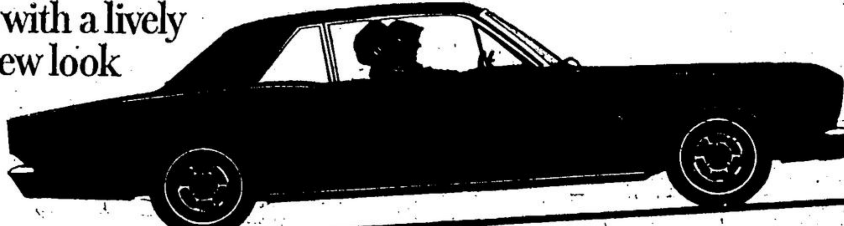
1966 FALCON FUTURA SPORTS COUPE WITH GREAT NEW PIZZAZZ

'66 Falcon has all the zip and style you're looking for, with typical Falcon economy. Falcon has 10 new models...more strength in the body...more room in the interior...more luxury throughout...and it's thrifter because it's stronger. Take a test-drive soon.