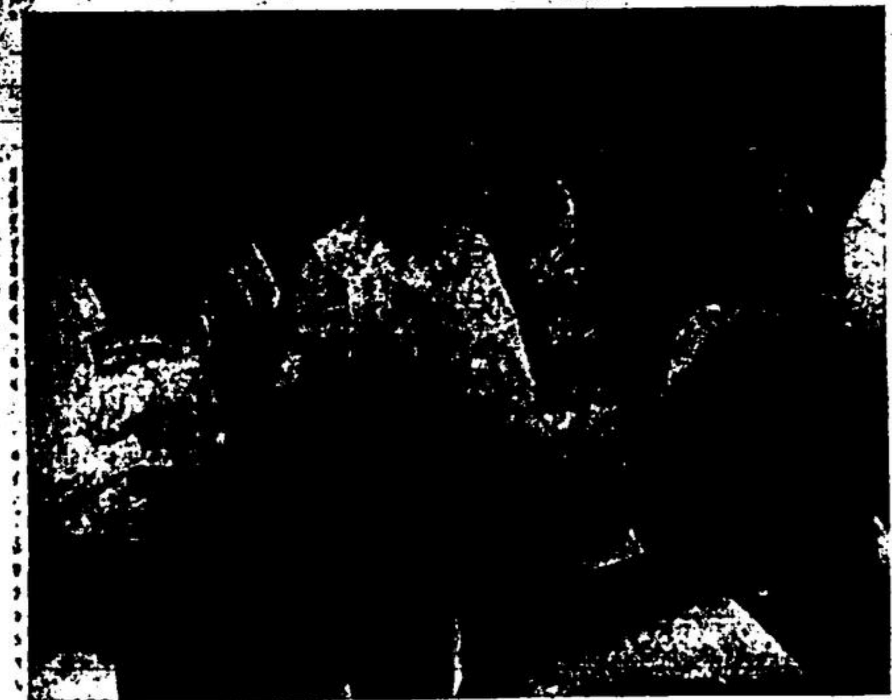
SHIVERING SWIM PUPILS wait around an instructor's table to hear the results of their tests.