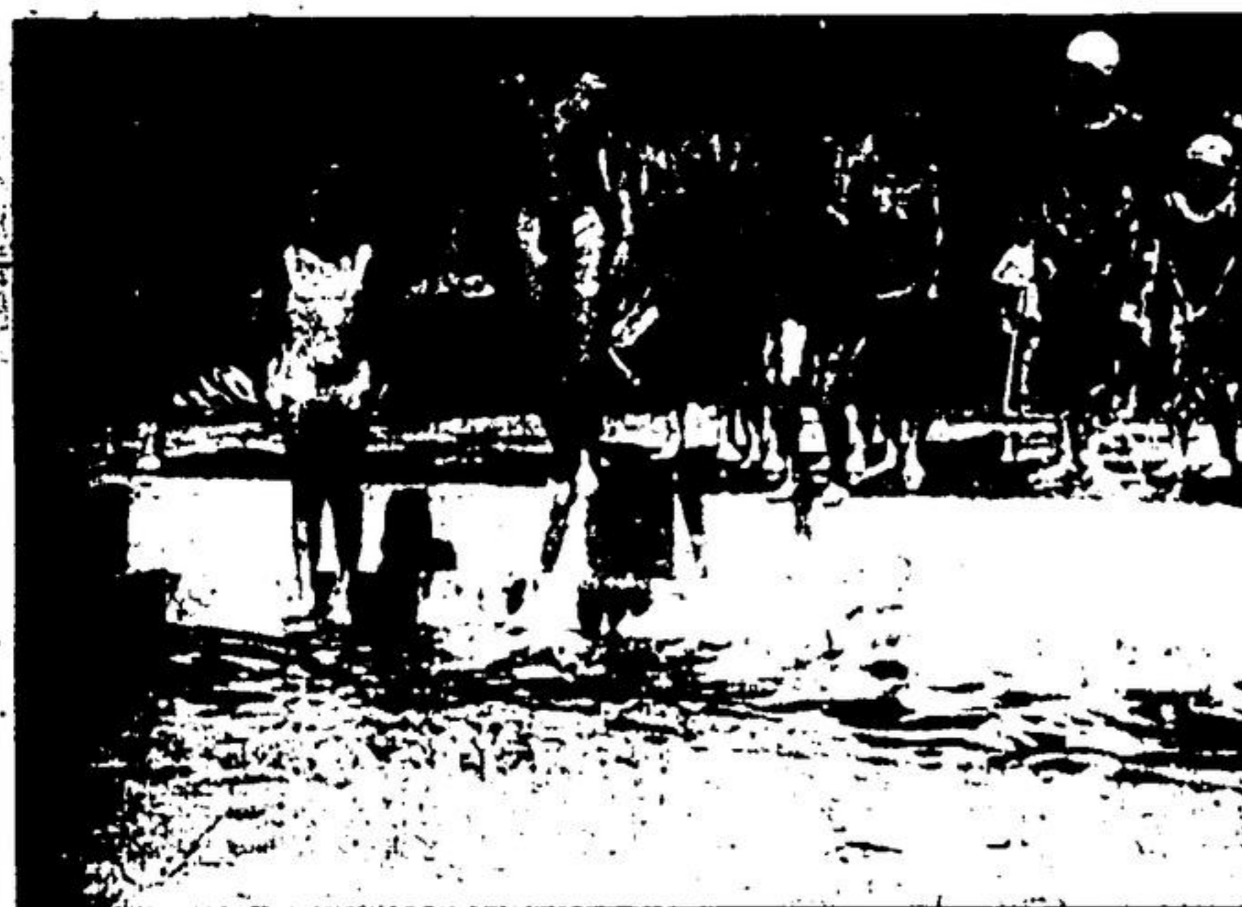
SWIMMERS WITH NUMBERS marked on their chests so the examiner can keep tabs on them jump into the pool's deep end.