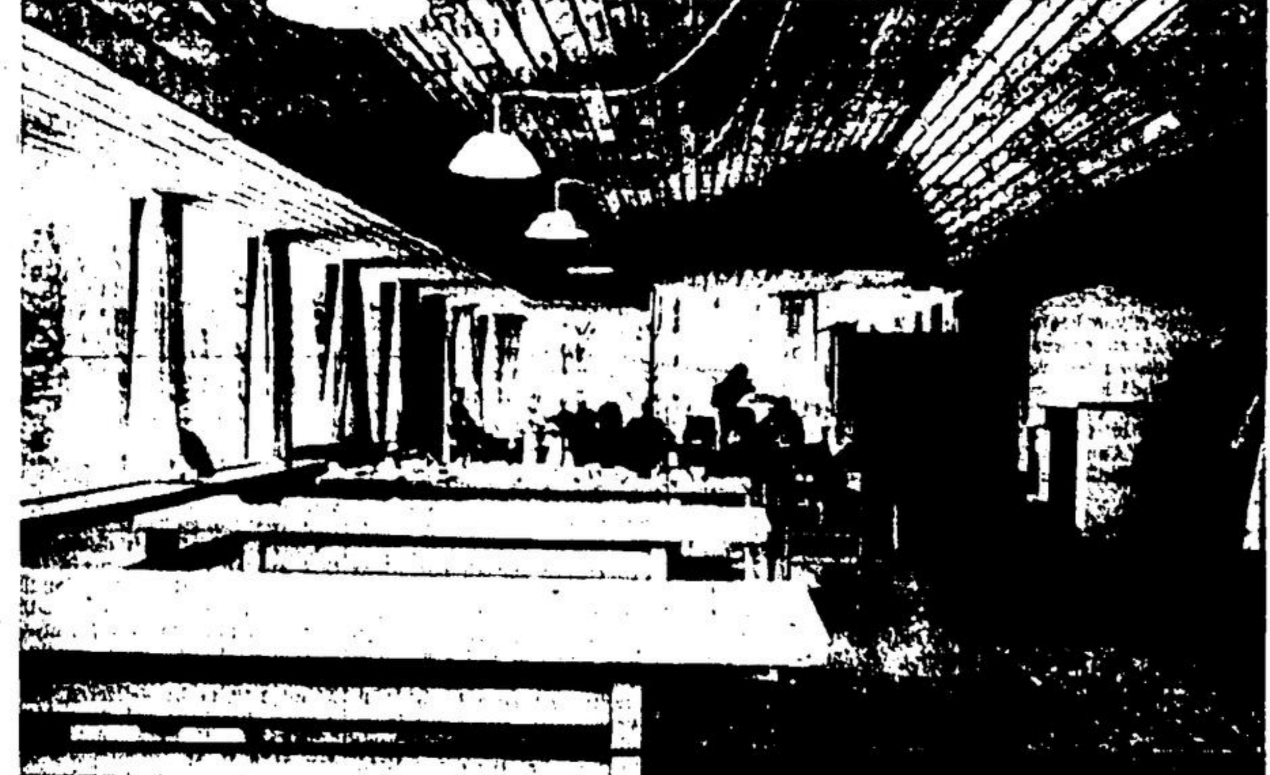
THE INTERIOR of the Natural Science building was inspected by over a thousand visitors Saturday.