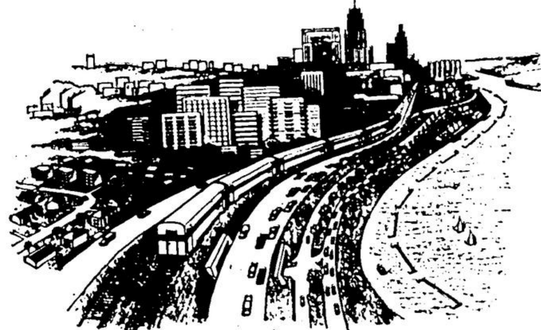
THIS ARTIST'S SKETCH depicts the type of train that will be used in the Ontario government's new railway commuter service to provide high frequency travel into Metro from outlying communities such as Georgetown. The first stage of the project will extend through the south of the county.