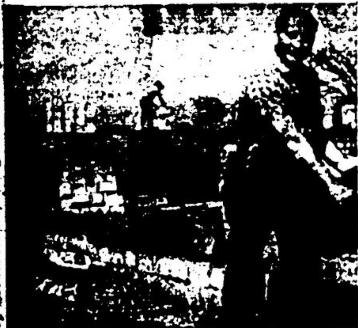
MAVEAL MOTORS at the corner of Main St. north and James will relocate on the highway when this new building now going up on Guelph St. opposite Delrex Blvd. is ready for occupancy.