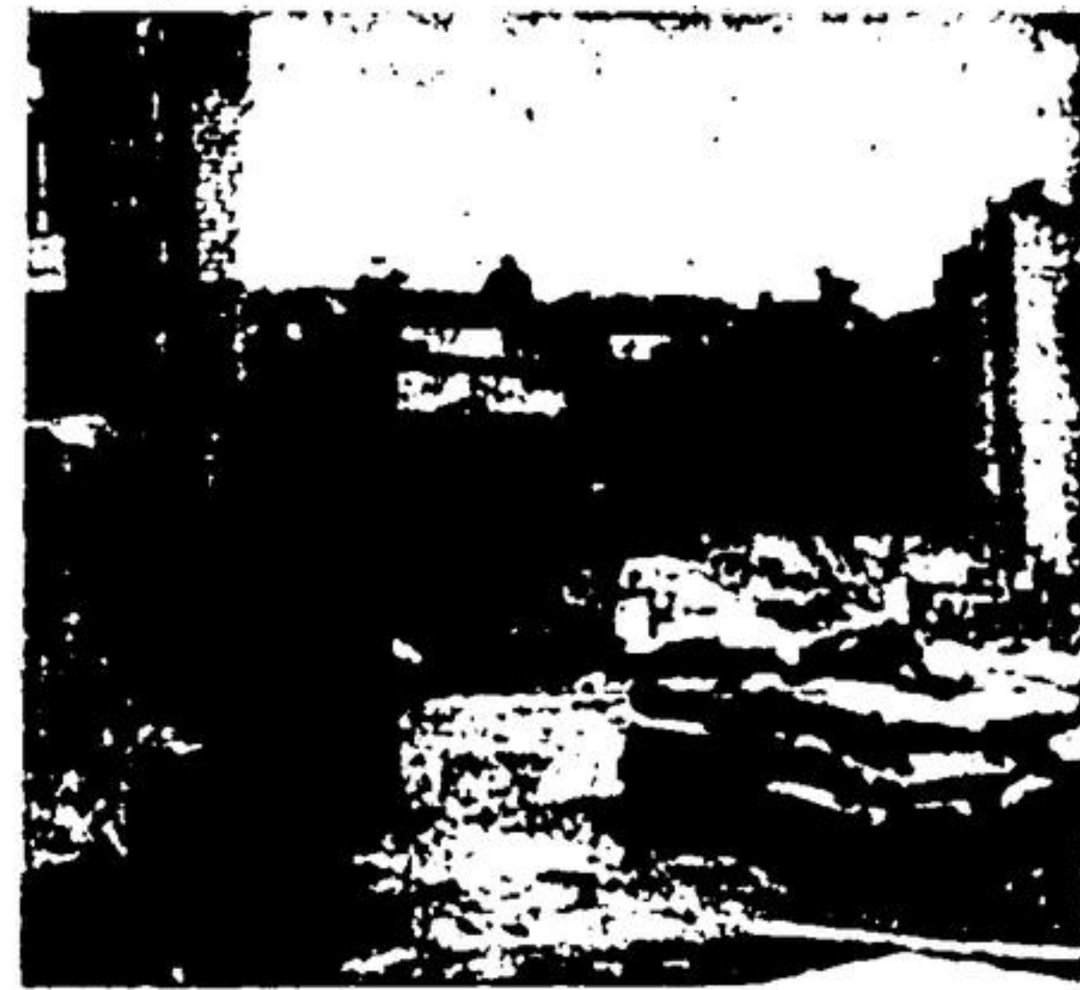
AN OEP APARTMENT BUILDING , the second to be erected here, is taking shape on Raylawn Crescent beside the first. The builders hope to have it ready for occupancy in July.