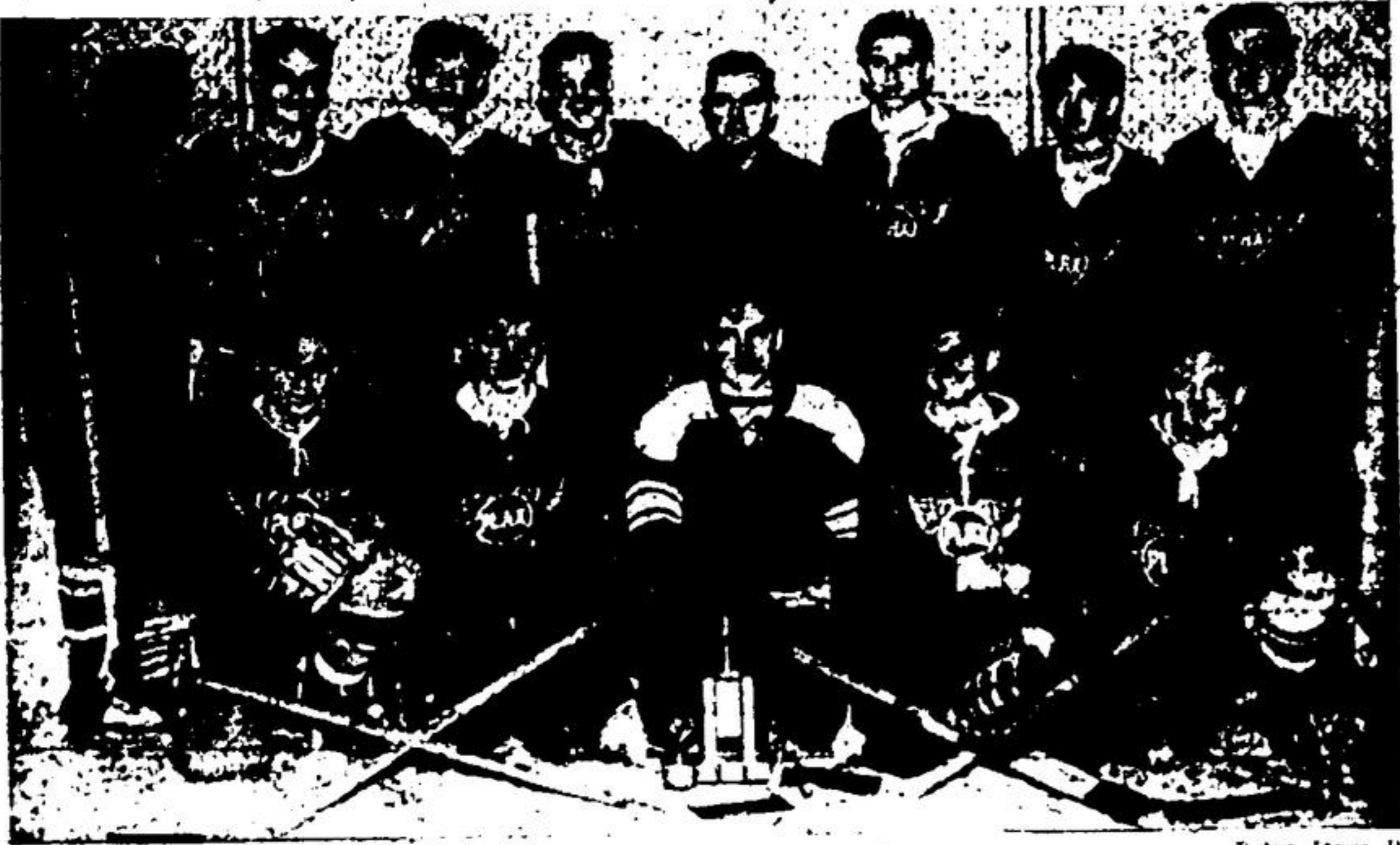
PLAX PACK REACHED PEAK