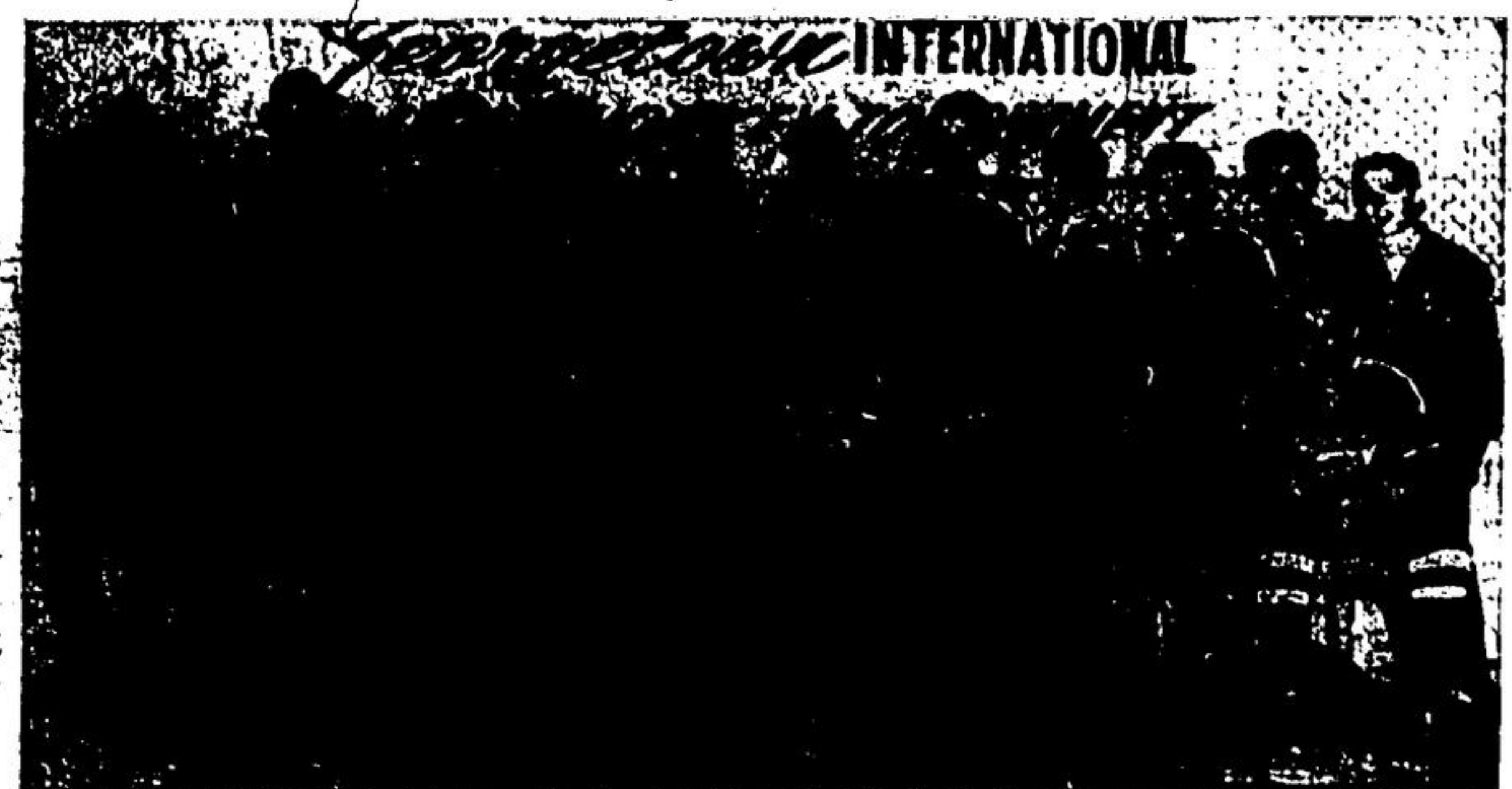
LEAMINGTON — 'C' Division Champions